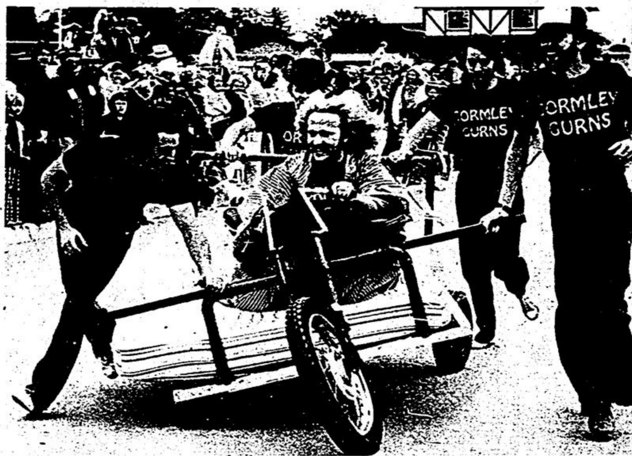
These bed race contestants didn't let a little thing like a bent front wheel discourage them. After a rather rough encounter with the obstacle part of the course, huge logs that they rammed, the Gormley Gurns continued right on, wobbling all the way.