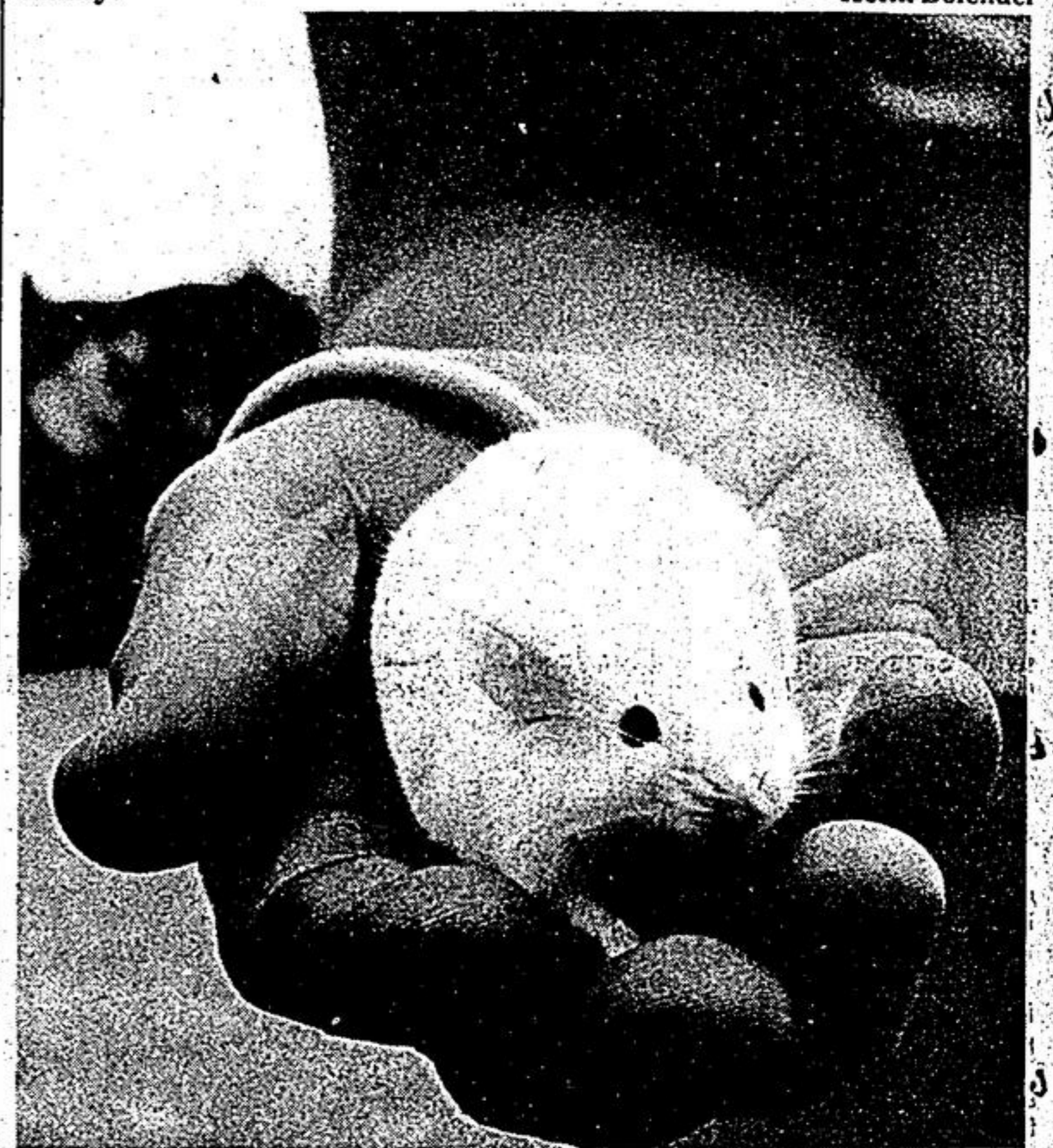
Everything from tadpoles to horses was entered in the Children's Pet Show on Homecoming weekend. This mouse won a prize as the second smallest entry.

Support the Canterbury Cathedral Appeal, Donations are tax deductible. Payable to the Royal Trust—Canterbury Cathedral Appeal at any branch of the Royal Trust Company. or mail to: Canterbury Cathedral Appeal P.O. Box 70, Station F, Toronto. M4Y 2L4