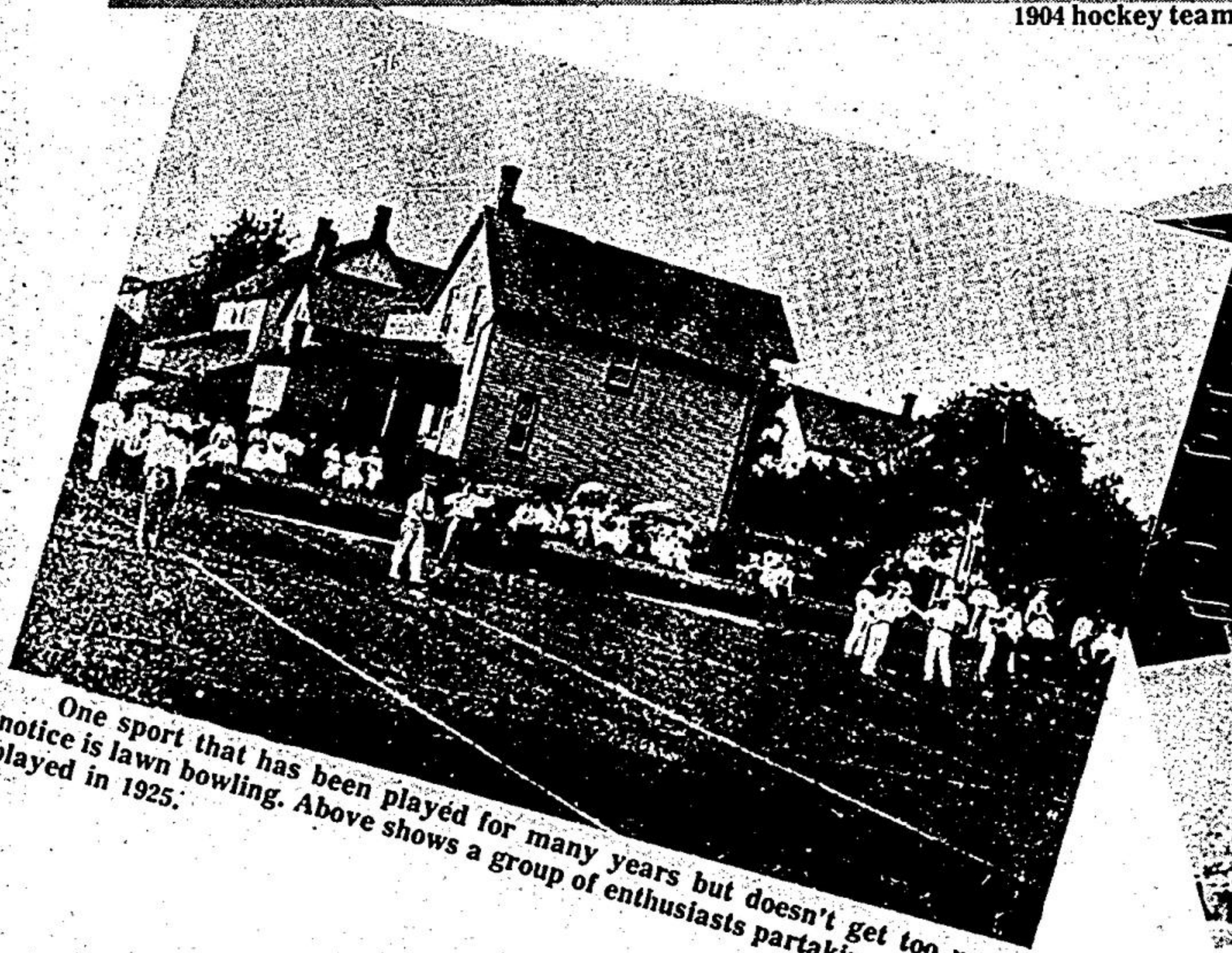
One sport that has been played for many years but doesn't get too much notice is lawn bowling. Above shows a group of enthusiasts partaking in a game played in 1925.