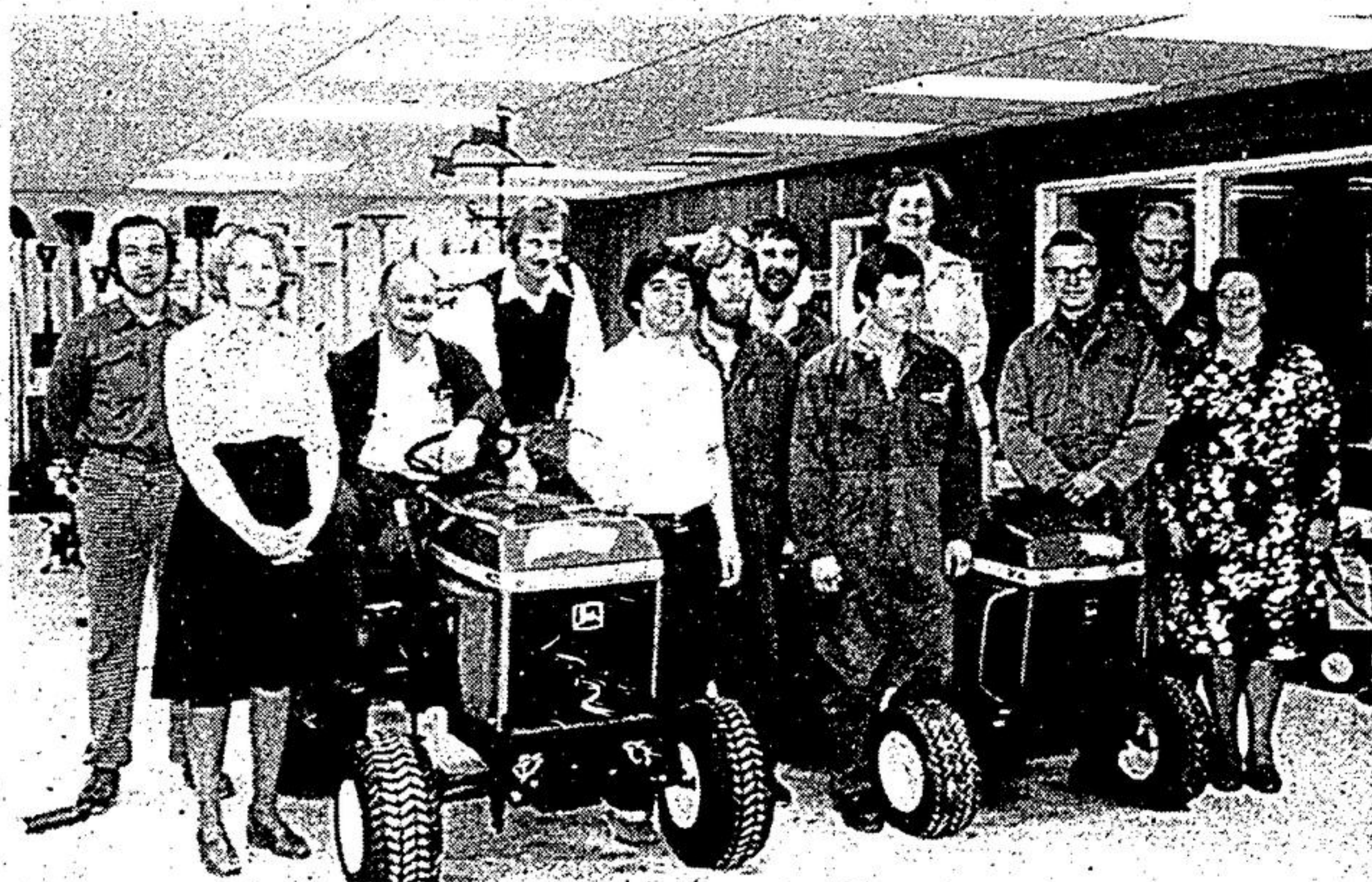
MANAGEMENT & STAFF