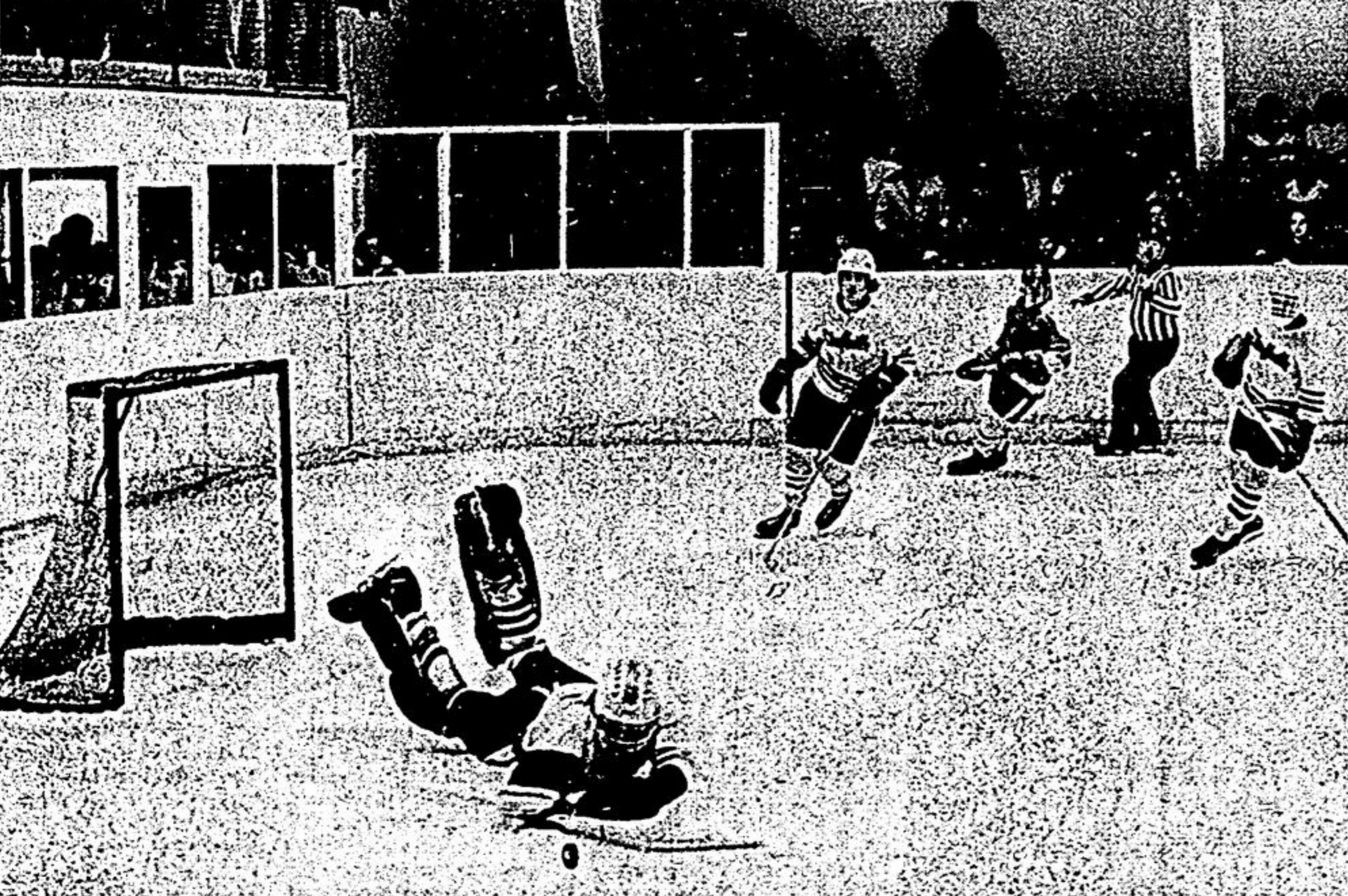
The Stouffville Don Anderson Bantam goalie makes a desperate lunge at the puck in an effort to retrieve it before the opposing Goderich team gets it. The game was the second one in the best of five provincial finals. The Goderich team clinched the series in Goderich last night by a 4-2 score.