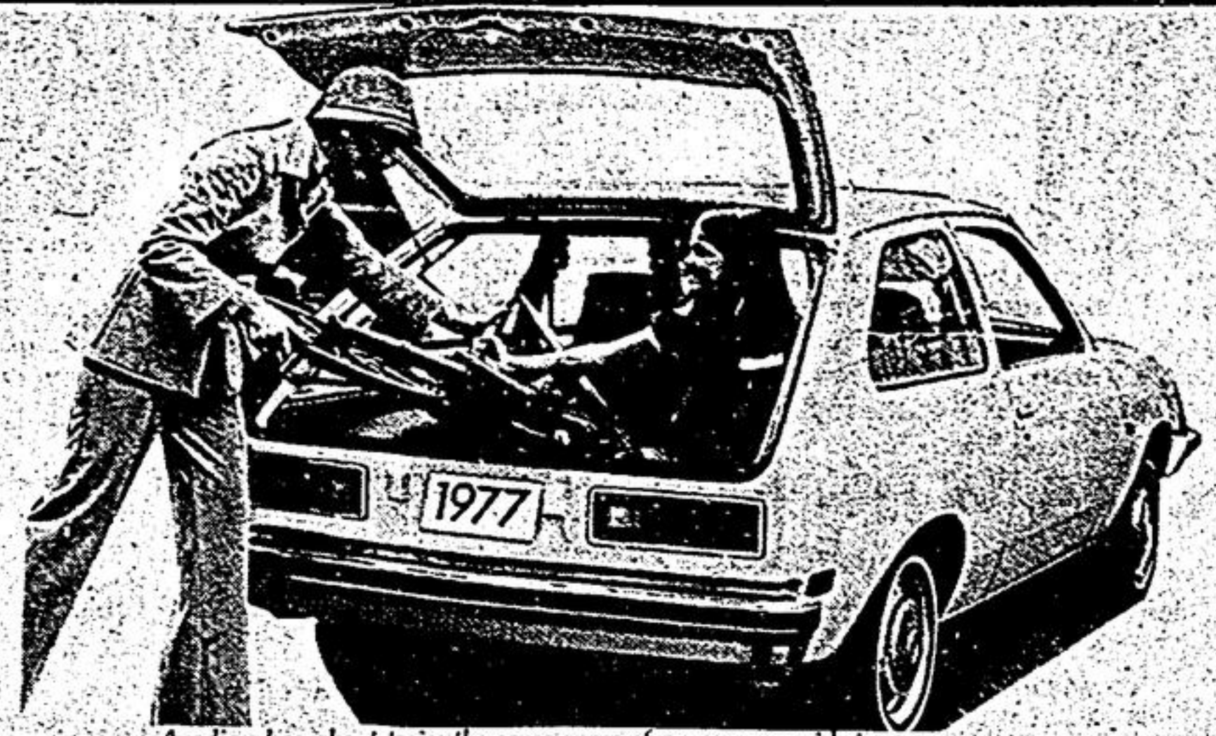
Acadian has about twice the cargo space of an average mid-size car.

*This mileage figure, returned by a Mini with standard transmission, was based on Transport Canadian approved test methods. The actual mileage you get will depend on your car's condition and equipment, driving conditions, and the kind of driving you do. †Manufacturer's suggested maximum list price. Dealer preparation, freight, license and taxes may be extra.