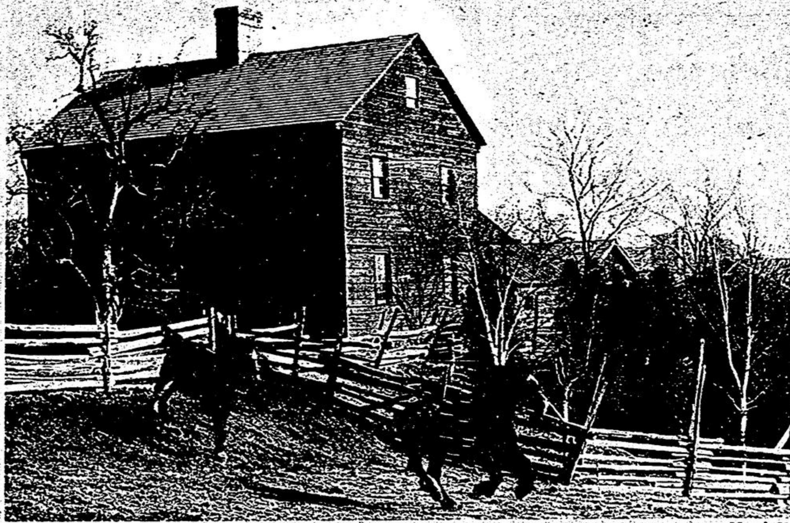
Horses are again frisking about the meadows at Black Creek Pioneer Village now that spring is making its timid debut. Black Creek opened for the '77 season on March 21.

Have you secured your tickets for the Spring Dance sponsored by the Victoria Square District Lions Club to be held in the Thornhill Community Centre on Saturday evening, March 26?