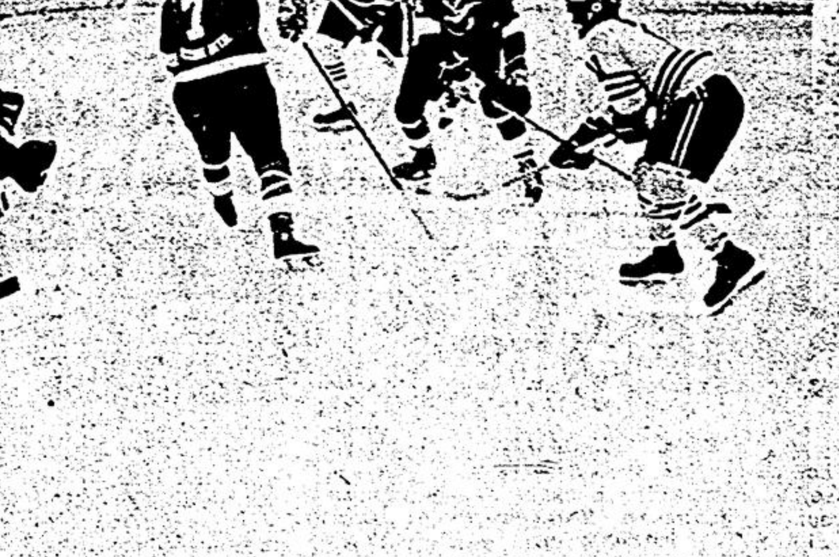
The Stouffville Clippers swarm over the Bowmanville Eagle's goalie, forcing him to make a glove save on the play. The game, which saw the Clippers lose by a 7-4 score, eliminated the Stouffville squad from the semi-final playoffs.