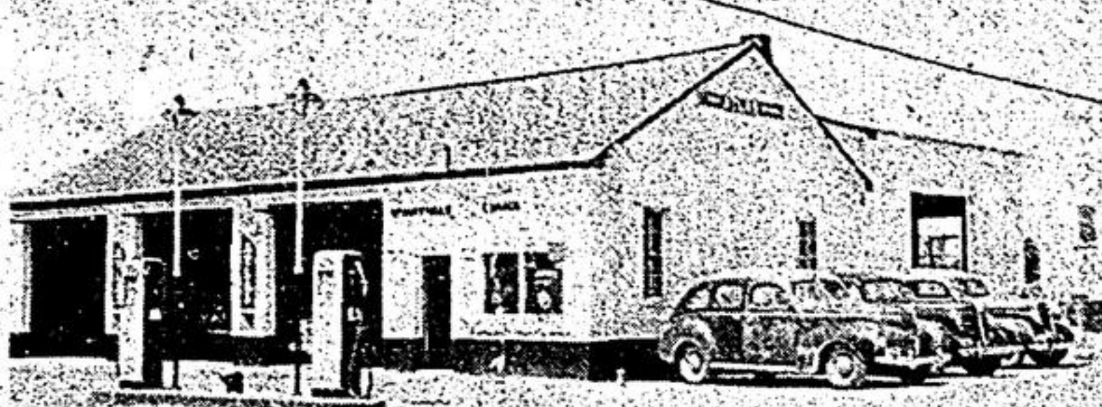
The Les Wilson garage has been rebuilt three times since its start, and this picture shows what it looked like after its second renovation.

garages for training mechanics. There's not enough emphasis on practical mechanic work, and we need more of that." To illustrate the number of years Les has been involved in cars, he cited a drastic comparison of the value of gas. "I remember when you could get gas for five gallons a dollar."