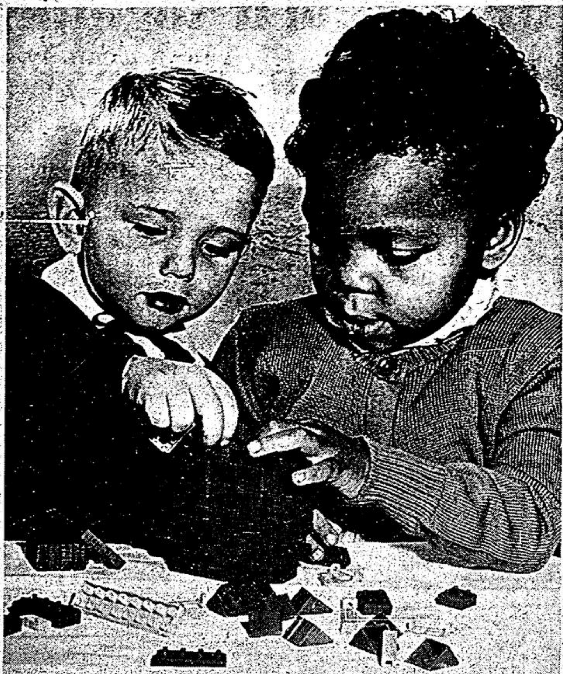
Represented best by the young, the ideal of respect for people and human rights is the underlying philosophy behind Brotherhood Week (Feb. 20 to 27). Initiated in Canada in 1947, Brotherhood Week is sponsored by the Canadian Council of Christians and Jews.