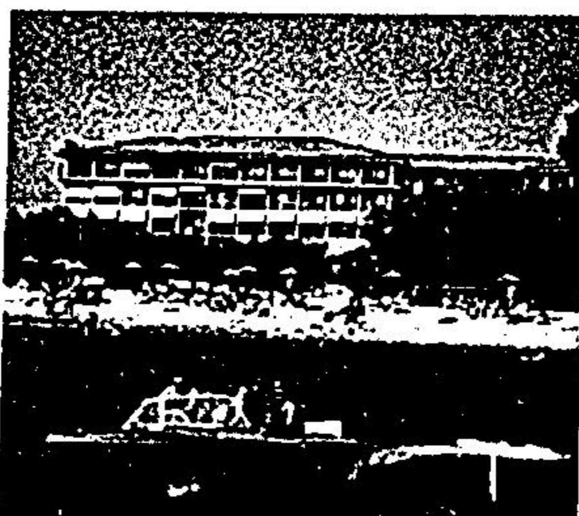
Holiday Cost Per Person Based on Double Occupancy