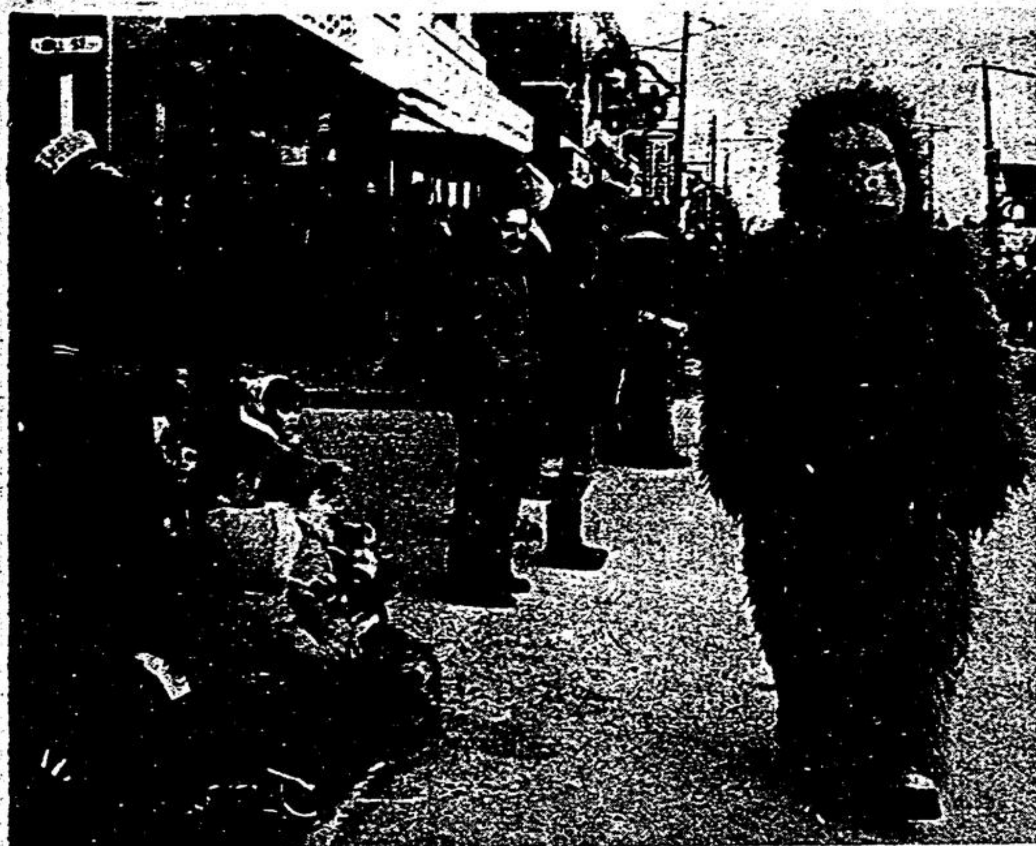
Benign and not so benign monsters strolled down Main Street during the Santa Claus parade, and all were