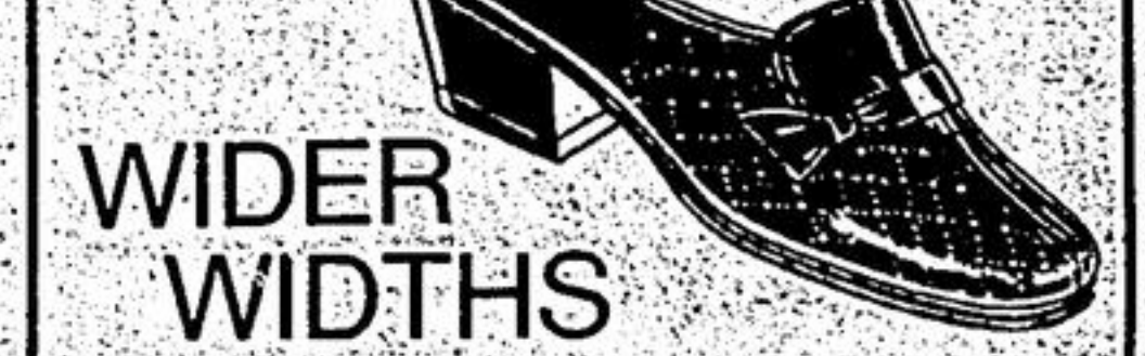
BLK. CALF $33.

WIDER WIDTHS B.D.EE. shields FOOTWEAR SOUTH-BLOCK RICHMOND HEIGHTS CENTRE RICHMOND HILL 884-5341