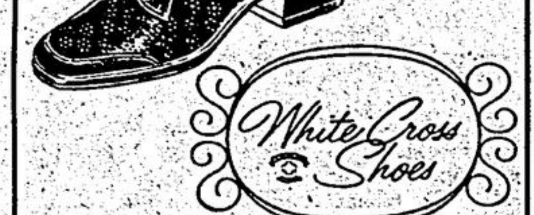
BLK. CALF BRN. CALF $34.

shields FOOTWEAR LTD. ANNOUNCES THE ADDITION OF WHITE CROSS SHOES TO THEIR COLLECTION OF FAMOUS BRAND NAMES