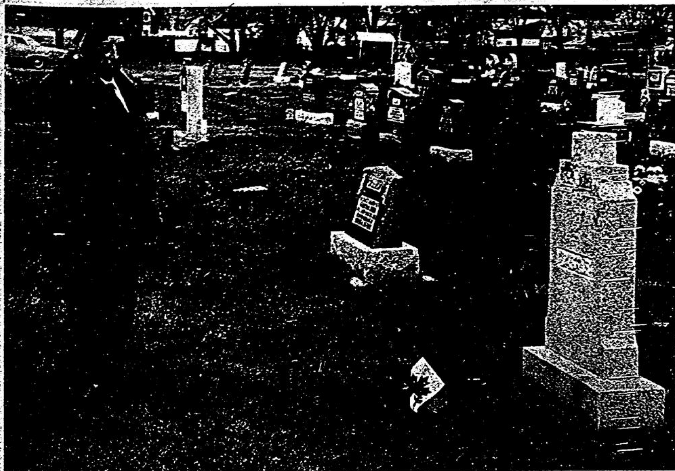
Before the parade and wreath laying ceremony Sunday, a group of veterans went up to the Stouffville Cemetery and laid poppies on the graves of war veterans. Fred Castle is a