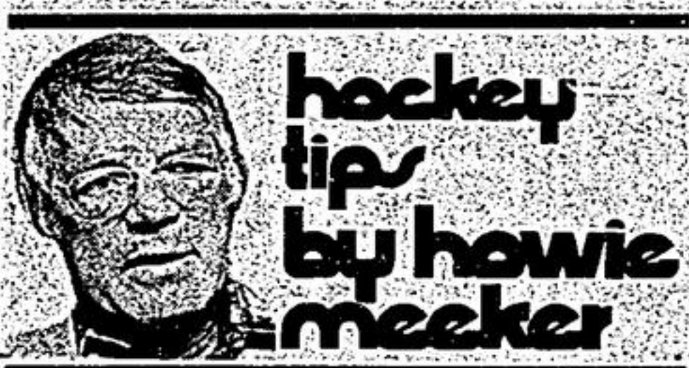
hockey tips by howie meeker