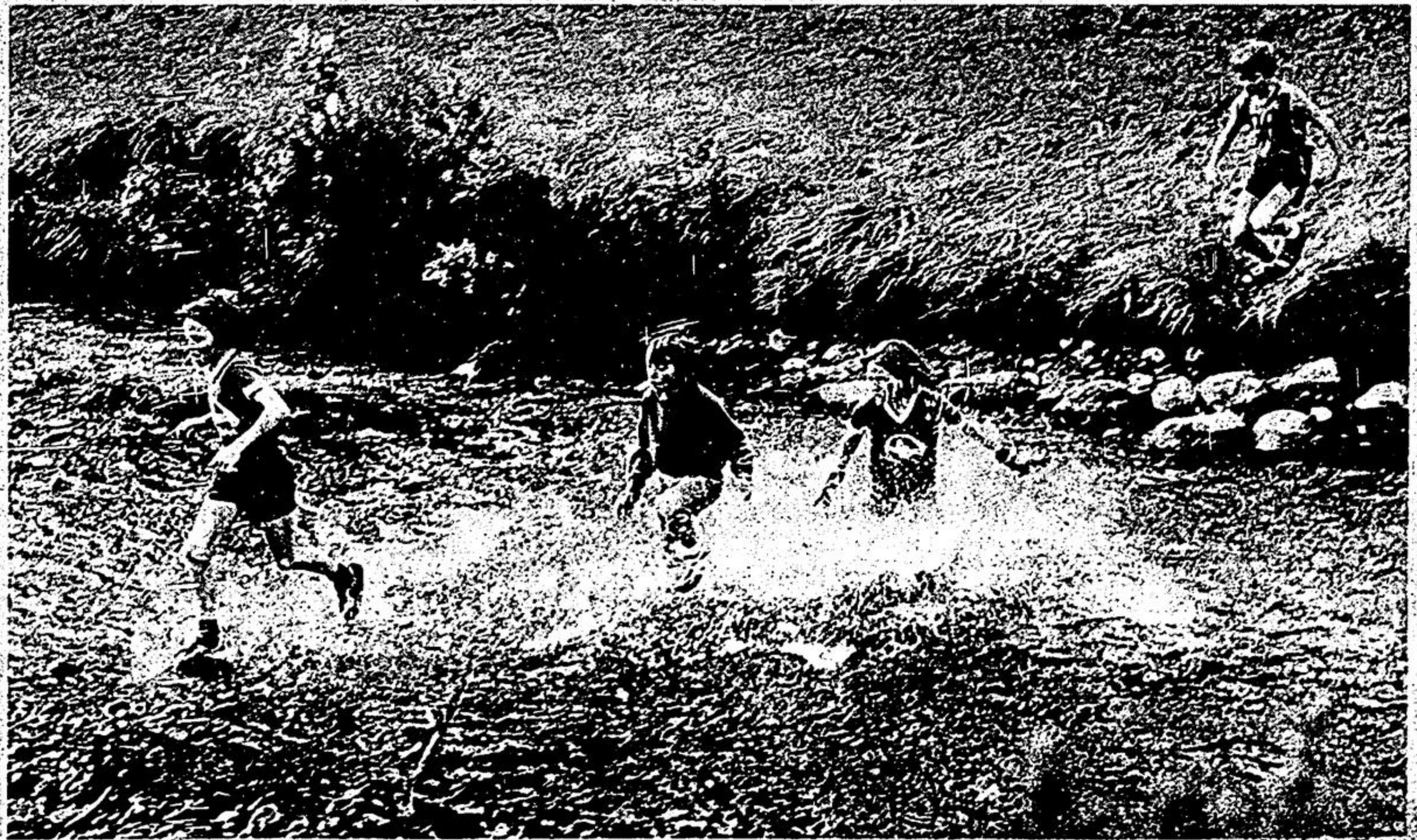
Fording an icy stream was an optional part of the Durham Athletic Association Cross County finals last week at Swiss Chalet Park, Greenwood. A more comfortable, although longer, passage across the stream was available by way of a foot bridge. The majority observed by the photographer chose the dry way. Altogether, a total of 1,000 boys and girls took part in the races.