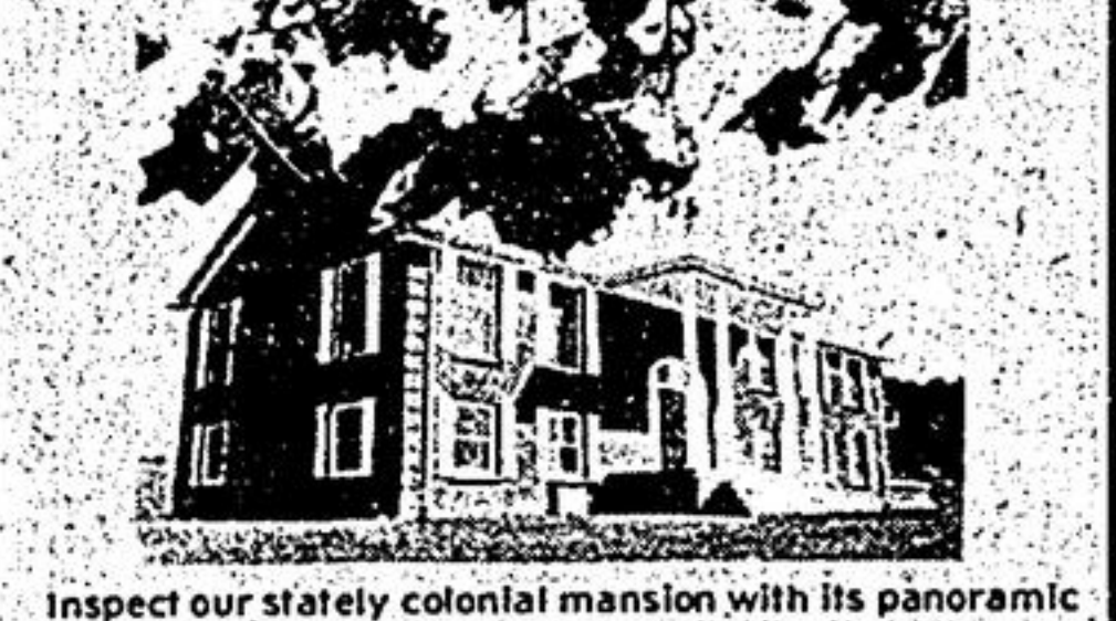
Inspect our stately colonial mansion with its panoramic view and innovative concepts.