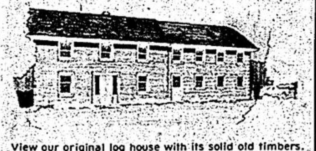
View our original log house with its solid old timbers.

Explore Bristol Pond Estates, a country setting of quiet, serene leisure and scenic vistas.