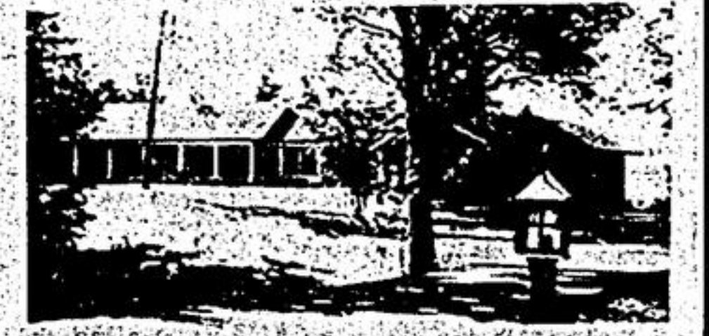
Inspect our spectacular totally planned bungalow with its 5300 sq. ft. of living area.

Drive north on Hwy. No. 48 to Bloomington Sideroad, east to Hwy. 47 to Concession 2, Uxbridge, north 2 miles to Bristol Pond Estates.