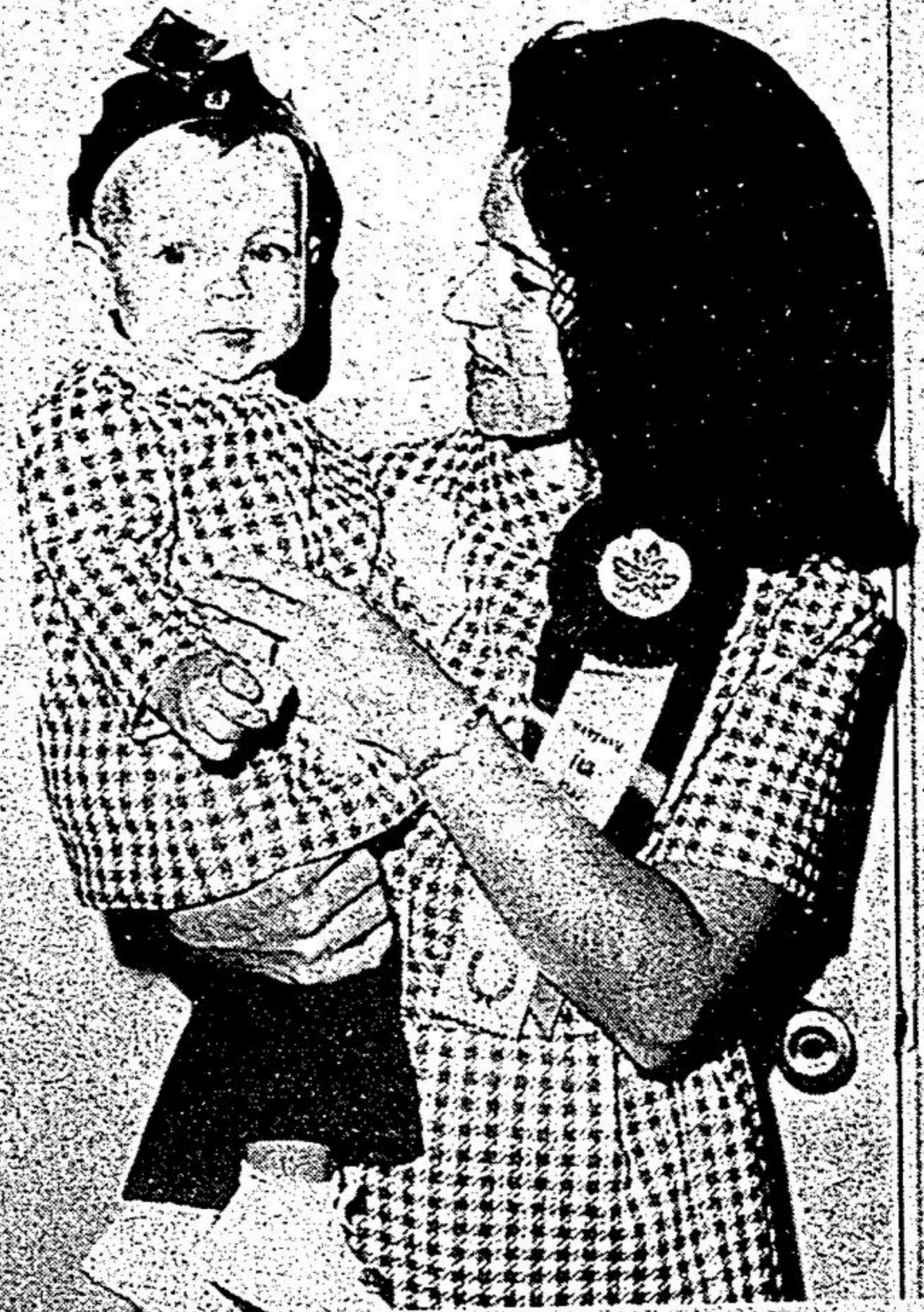
Meet the champ — the best baby at Markham Fair '75. The baby contest, revived last year, attracted many entries and much interest. It will be continued this year. The little guys and gals will promenade in public on Saturday, Oct. 2 at 1 p.m.