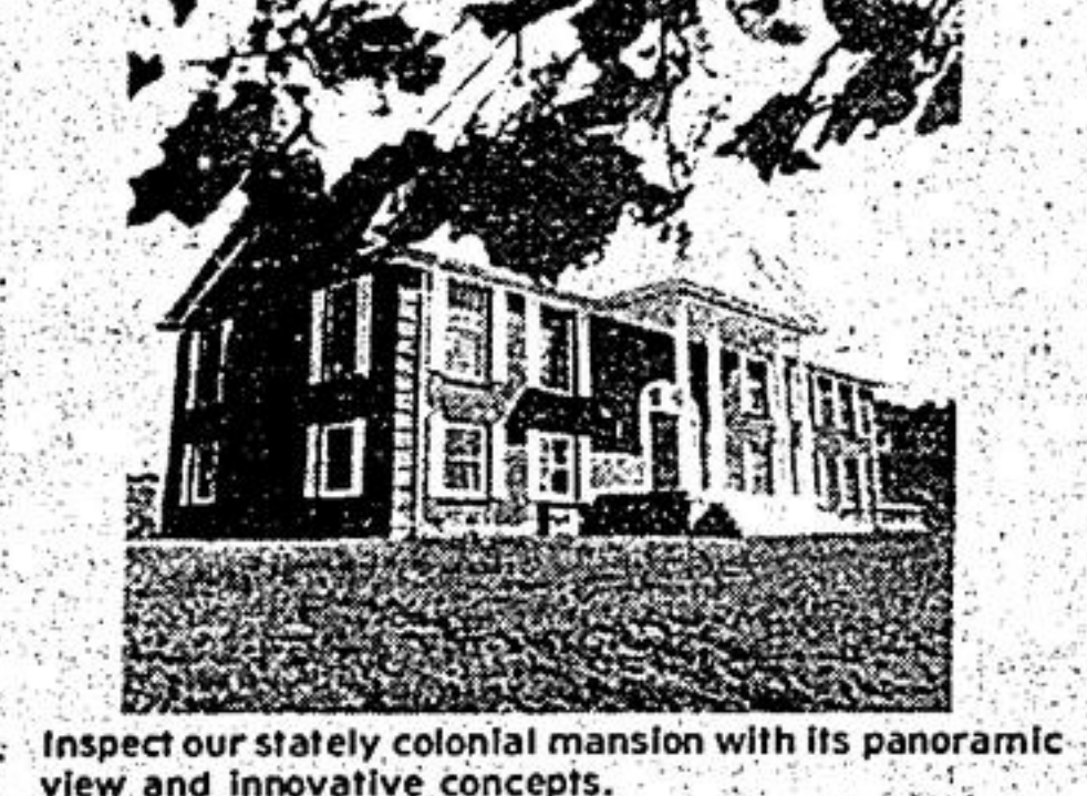
Inspect our stately colonial mansion with its panoramic view and innovative concepts.