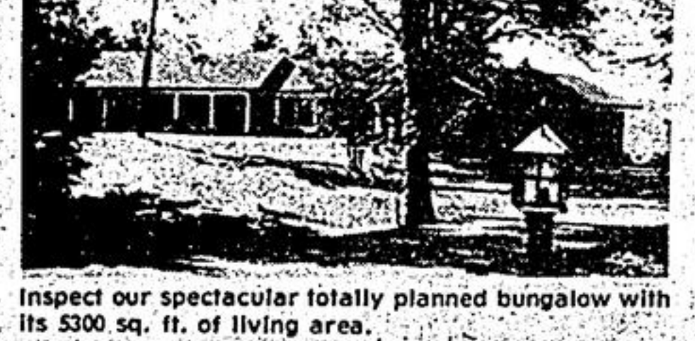
Inspect our spectacular totally planned bungalow with its 5300 sq. ft. of living area.

Drive north on Hwy. No. 48 to Bloomington Sideroad, east to Hwy. 47 to Concession 2, Uxbridge, north 2 miles to Bristol Pond Estates.