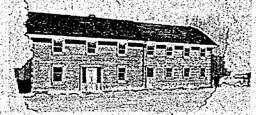
View our original log house with its solid old timbers.