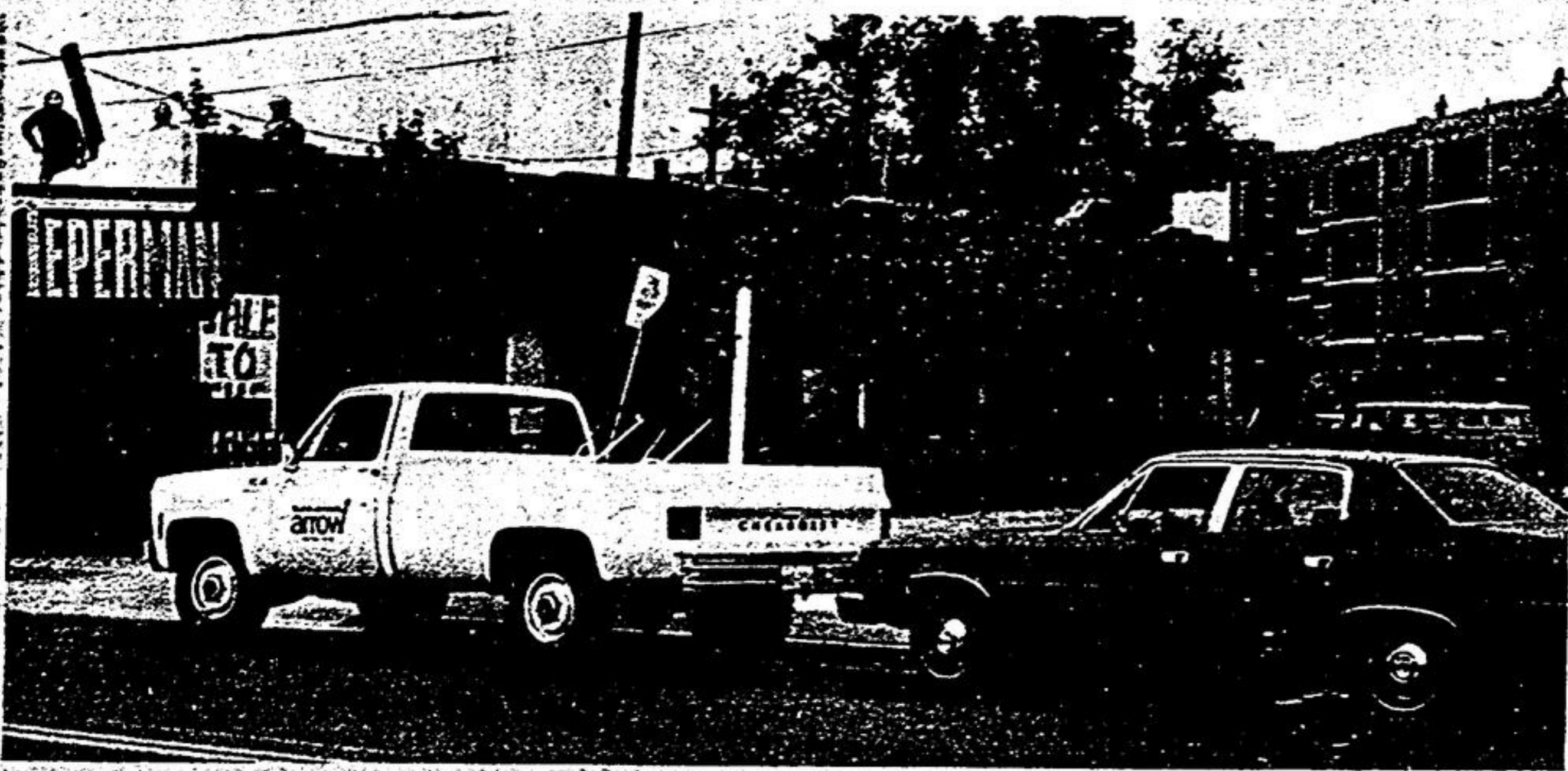
One of the oldest buildings in Markham is being rapidly demolished to make way for the senior citizens' apartments slowly rising in the background. The structure, built 150 years ago to house the Speight Wagon Company, later accommodated a number of other businesses. John's Hideaway, a furniture store was the last tenant.