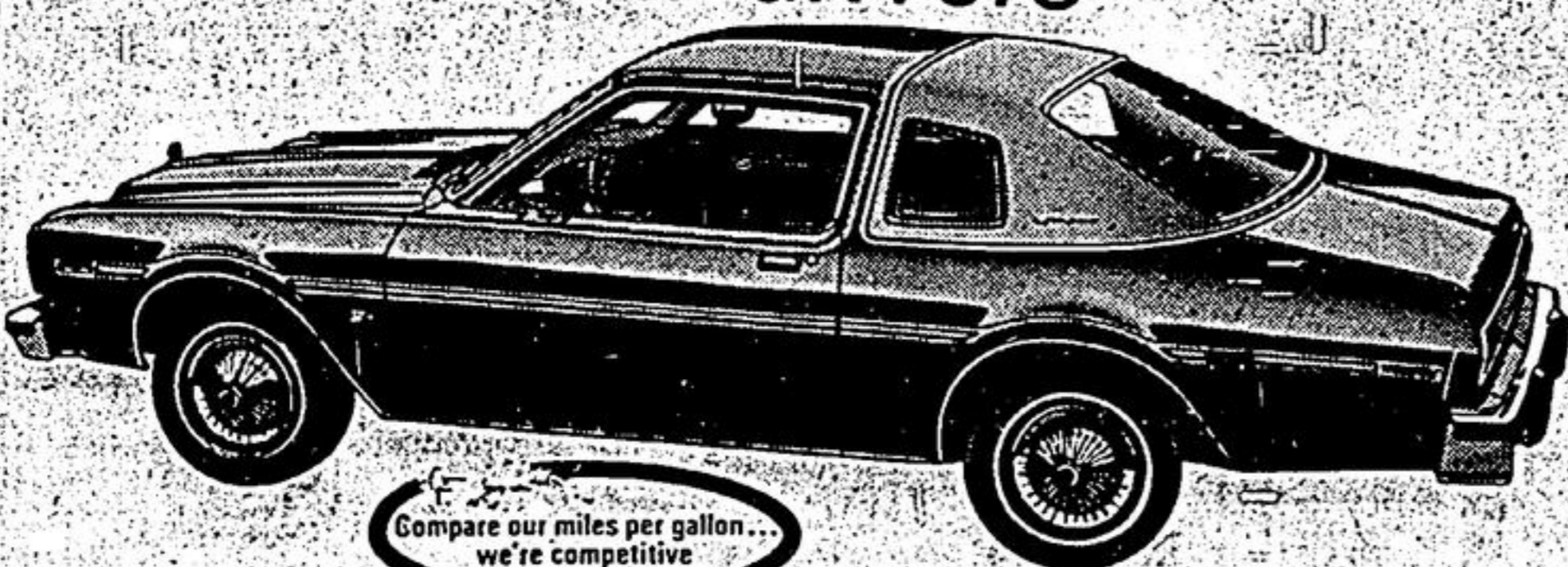
Compare our miles per gallon... we're competitive