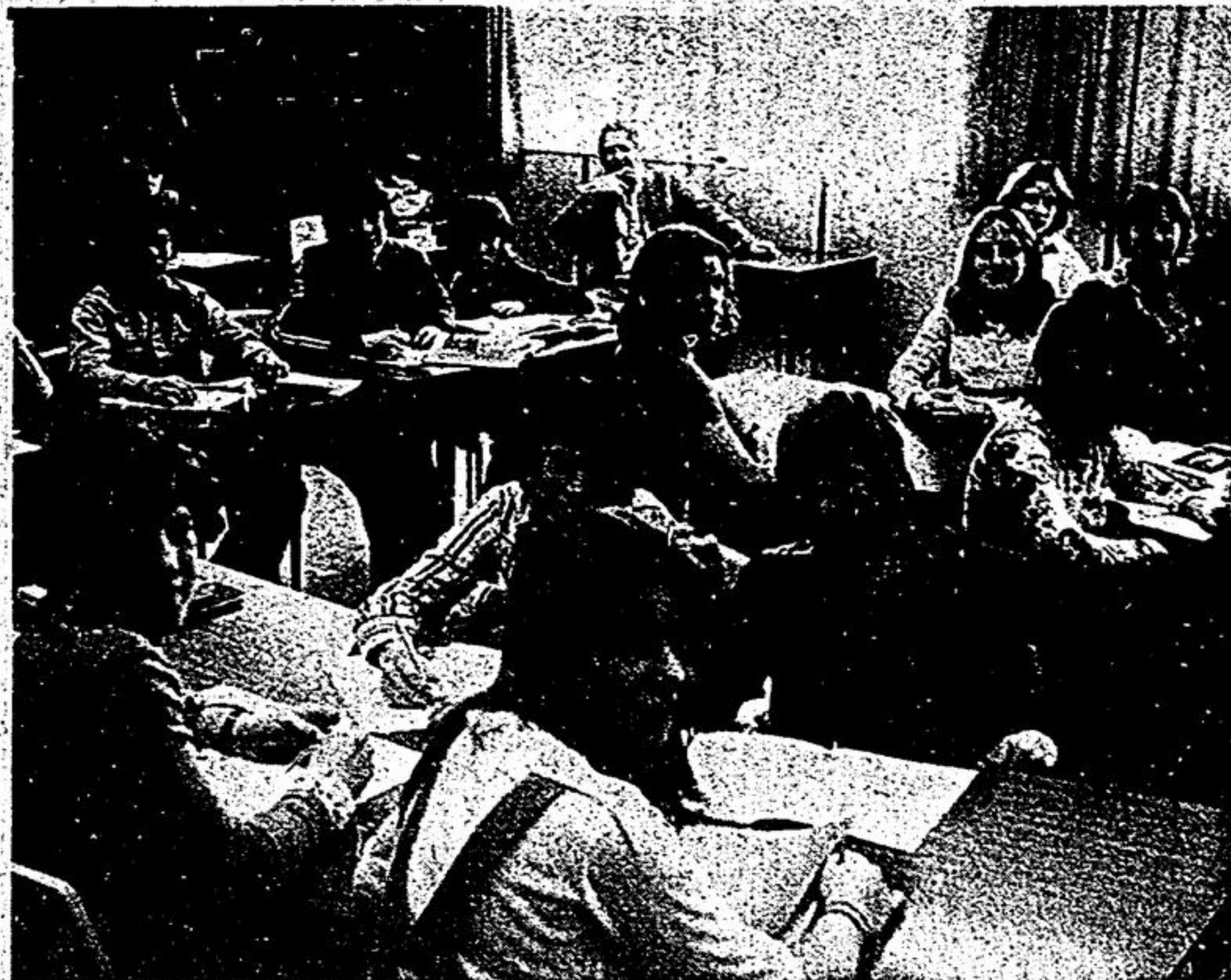
Students at St. Joseph's Separate School in Markham are facing some of the same problems facing Summitview Public School in

Three of the school's portables came in 1974 and three more in 1975. Cost of the mobile classrooms is about $12,000 to $13,000 including installation.