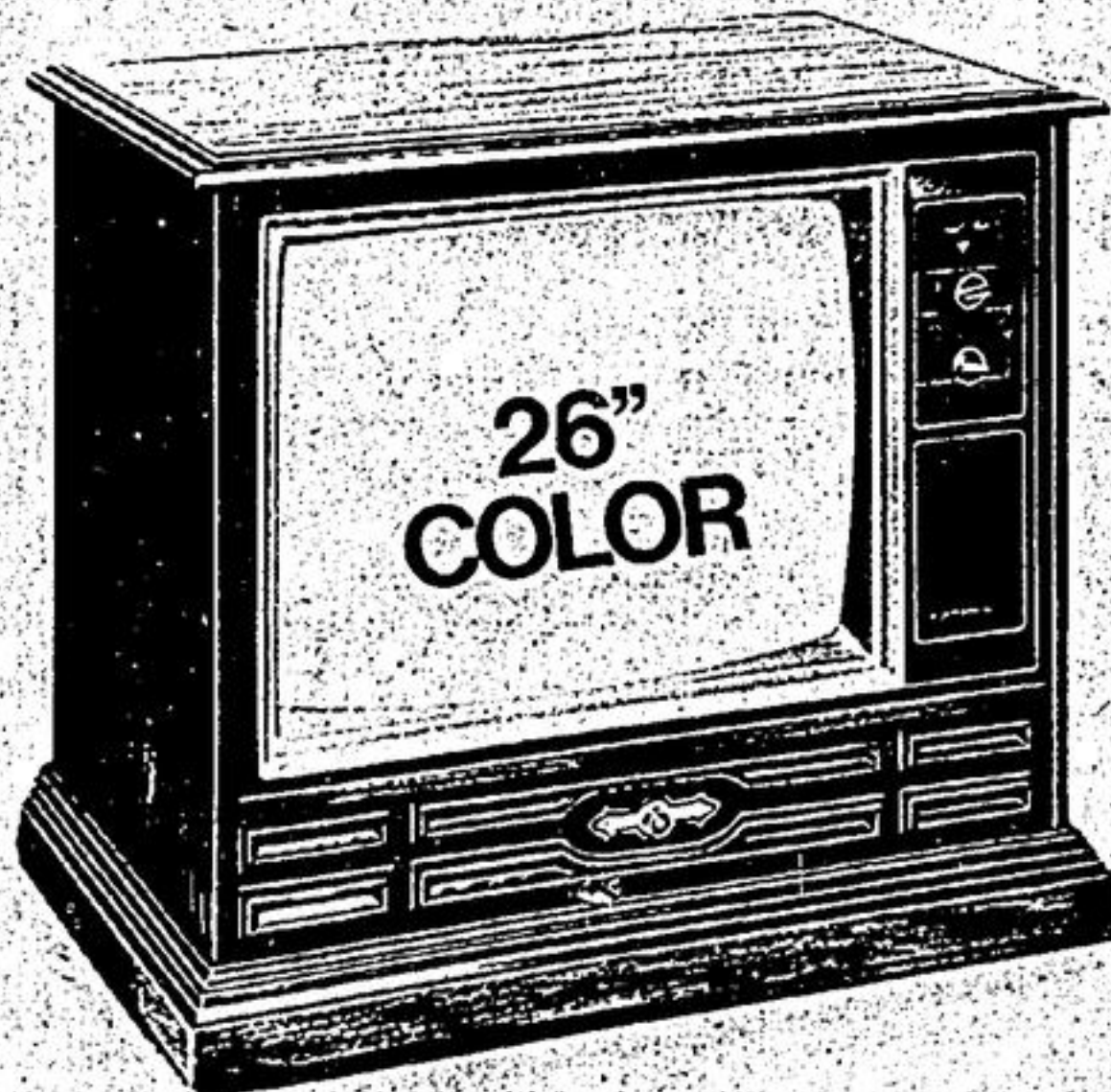
HARCOURT 26" CONSOLE COLOR TV