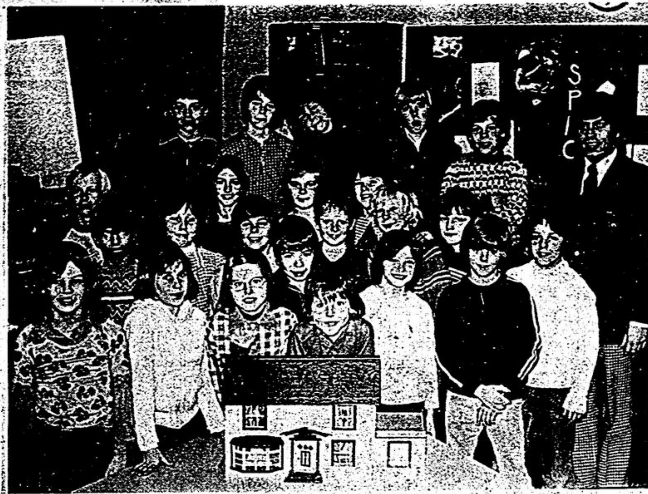
The Grade 5 students stand around a doll house presented to the class by a resident of Stouffville Nursing Home. The children have been making weekly visits to the residents of nursing home, to visit the lonely people there. It ties in with their religion course which involves giving to others.