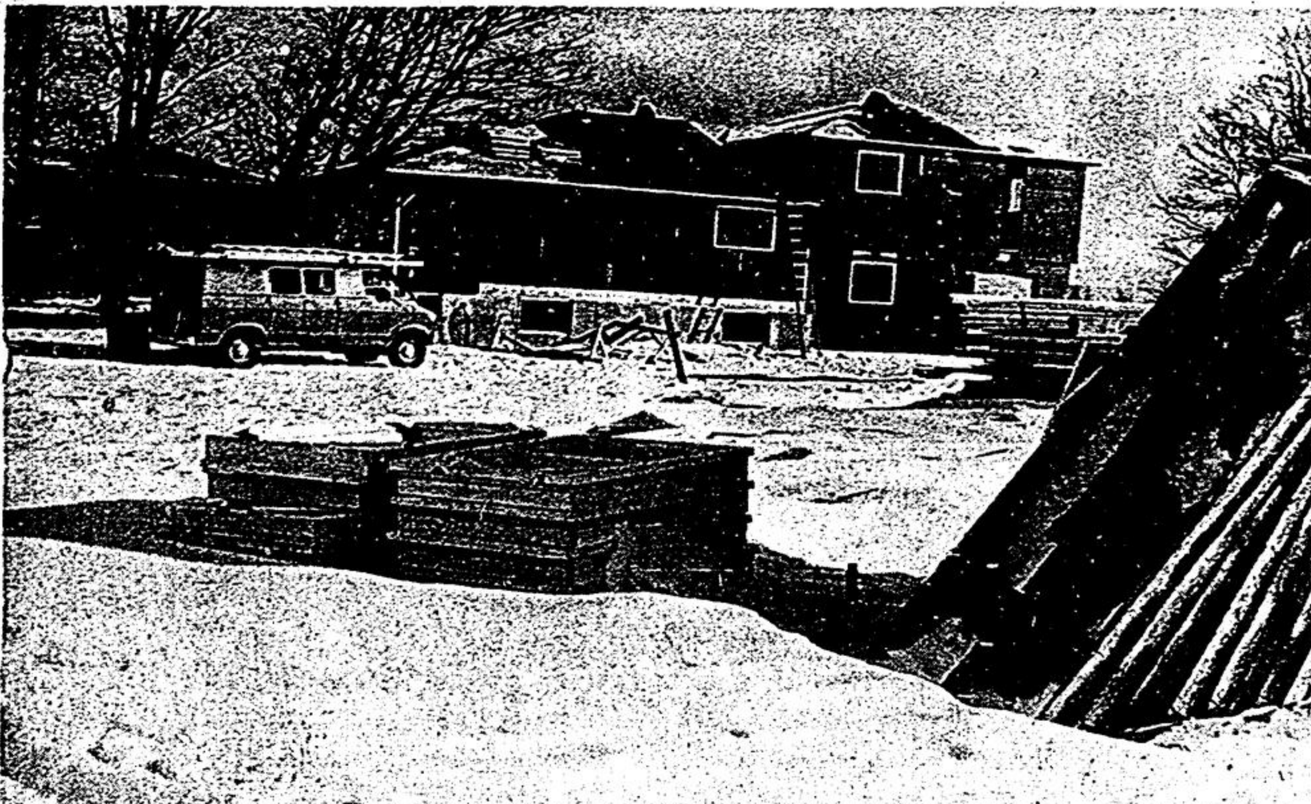
"Checkmate Acres" a small subdivision at Bloomington Rd. and the 9th Line is taking shape as the first four houses go up in the development. Although the developer is presently at cross purposes with council over mining gravel, the subdivision is going ahead. The theme is based on "Chess" and some of the houses are built with parts that resemble chess men. Even the name of the subdivision comes from chess terminology. — Don Bernard