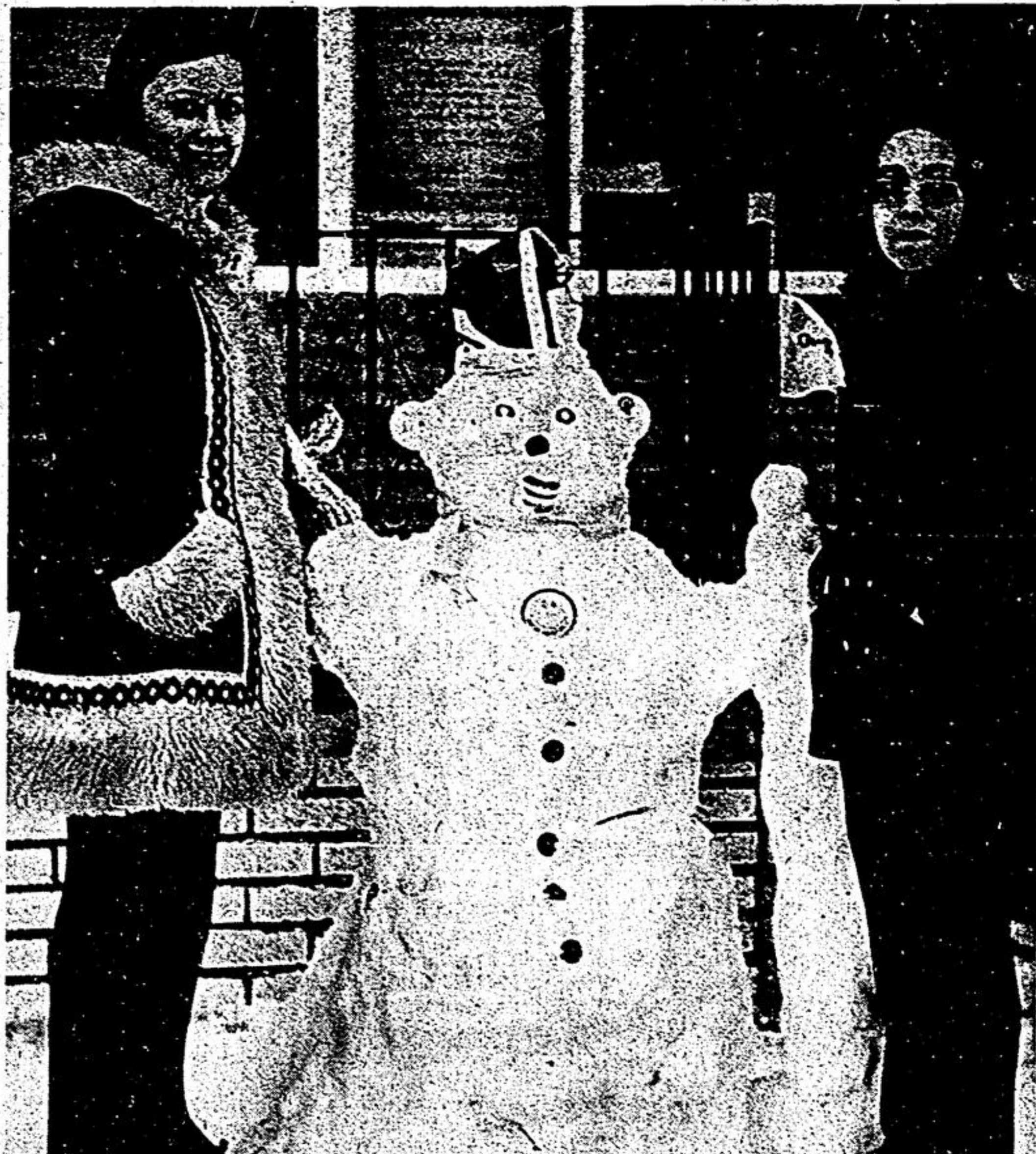
These two employees of Stouffville Guaranty Trust improvised a most unusual snowman last week, with a plastic bag for a hat and a Handi-wipe for a scarf, among other