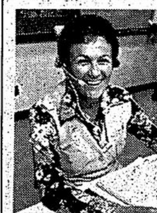
"Our new Red, White and Blue fare plan makes it easier to save."