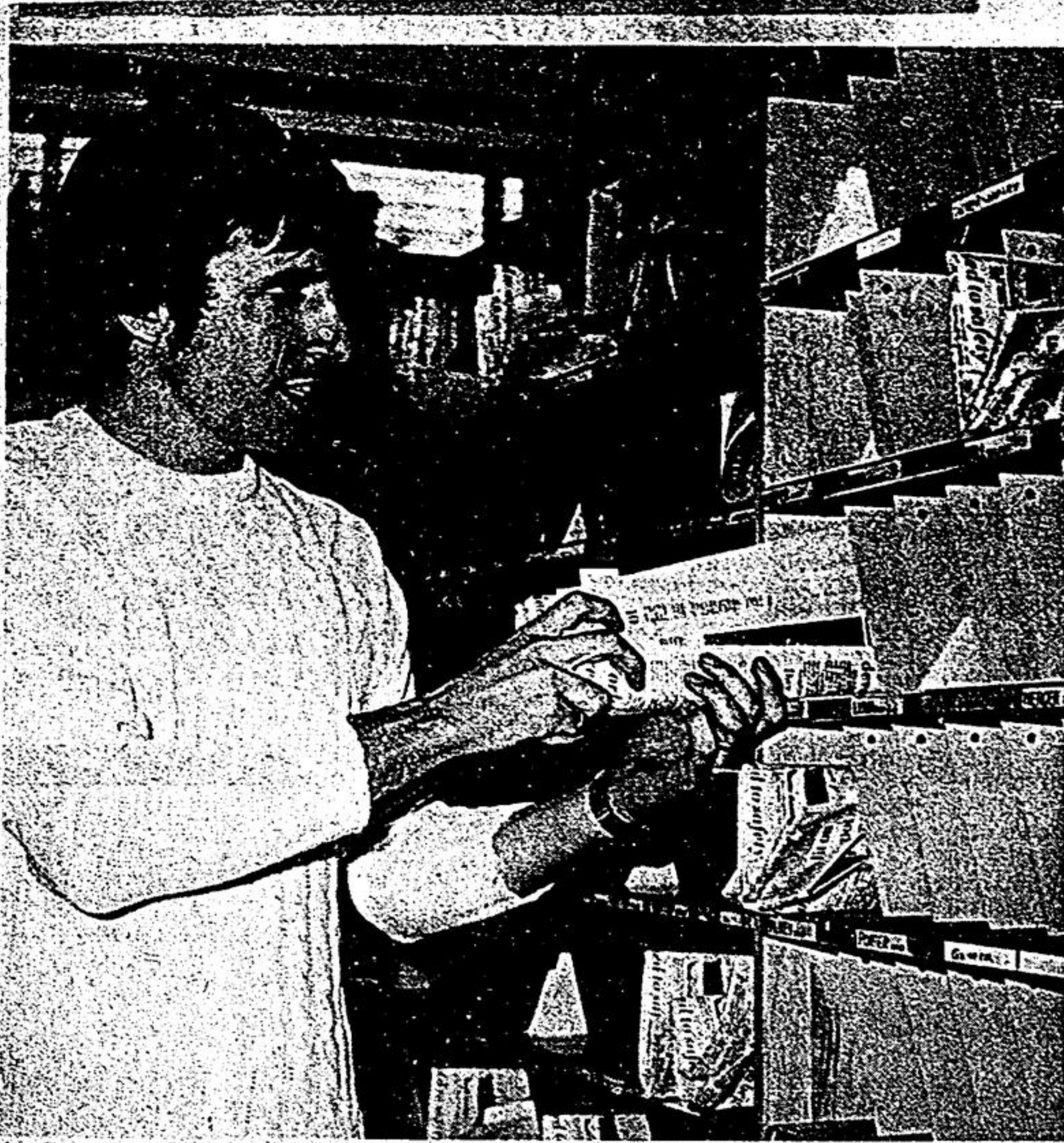
Except for sorting copies of The Tribune and other newspapers, all tends to be quiet at the Claremont post office these days. Workers there are not members of the striking C.U.P.W. union and the current problem

The convention is slated for Feb. 22, 1976 in Ottawa and will choose a successor to leader Robert Stanfield. The Ontario riding meeting will be Wednesday, Nov. 19 at 8 p.m. at the Claremont Legion Hall. Other business on the agenda will involve the elections of officers for the coming year.