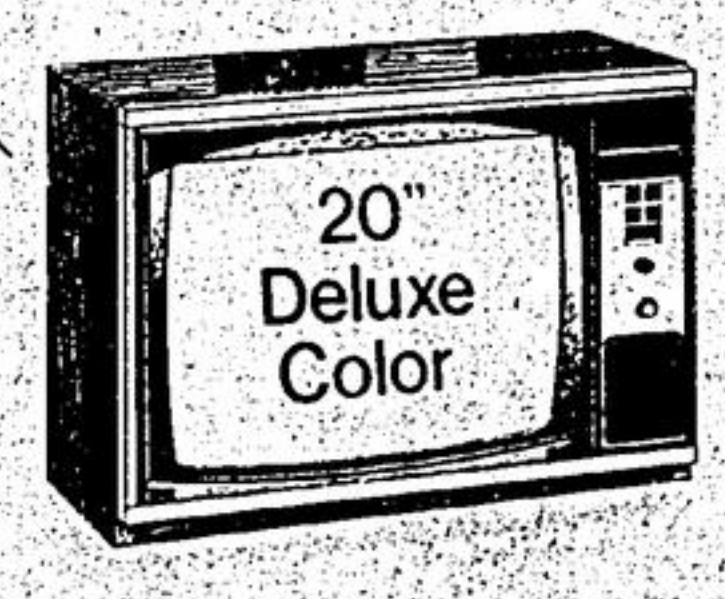
The Ventura C23-404 — C23 performance in a 20" portable (no remote control) ..... $749.95