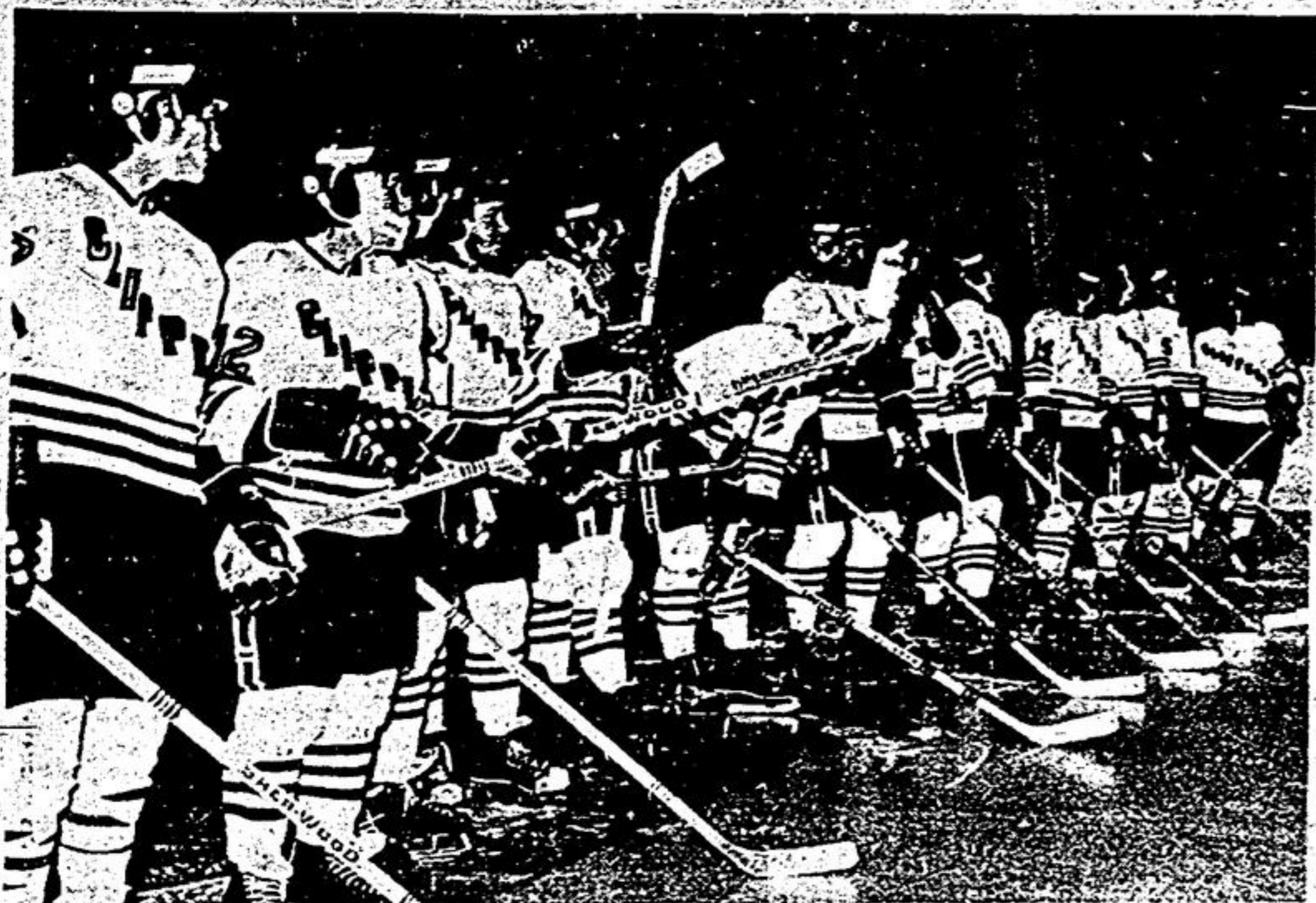
Stouffville Clippers made their debut Saturday night and lost to a better-conditioned Port Perry team. The team, made up mostly

of players from last year's provincial champion juvenile squad, brings junior hockey back to Stouffville.