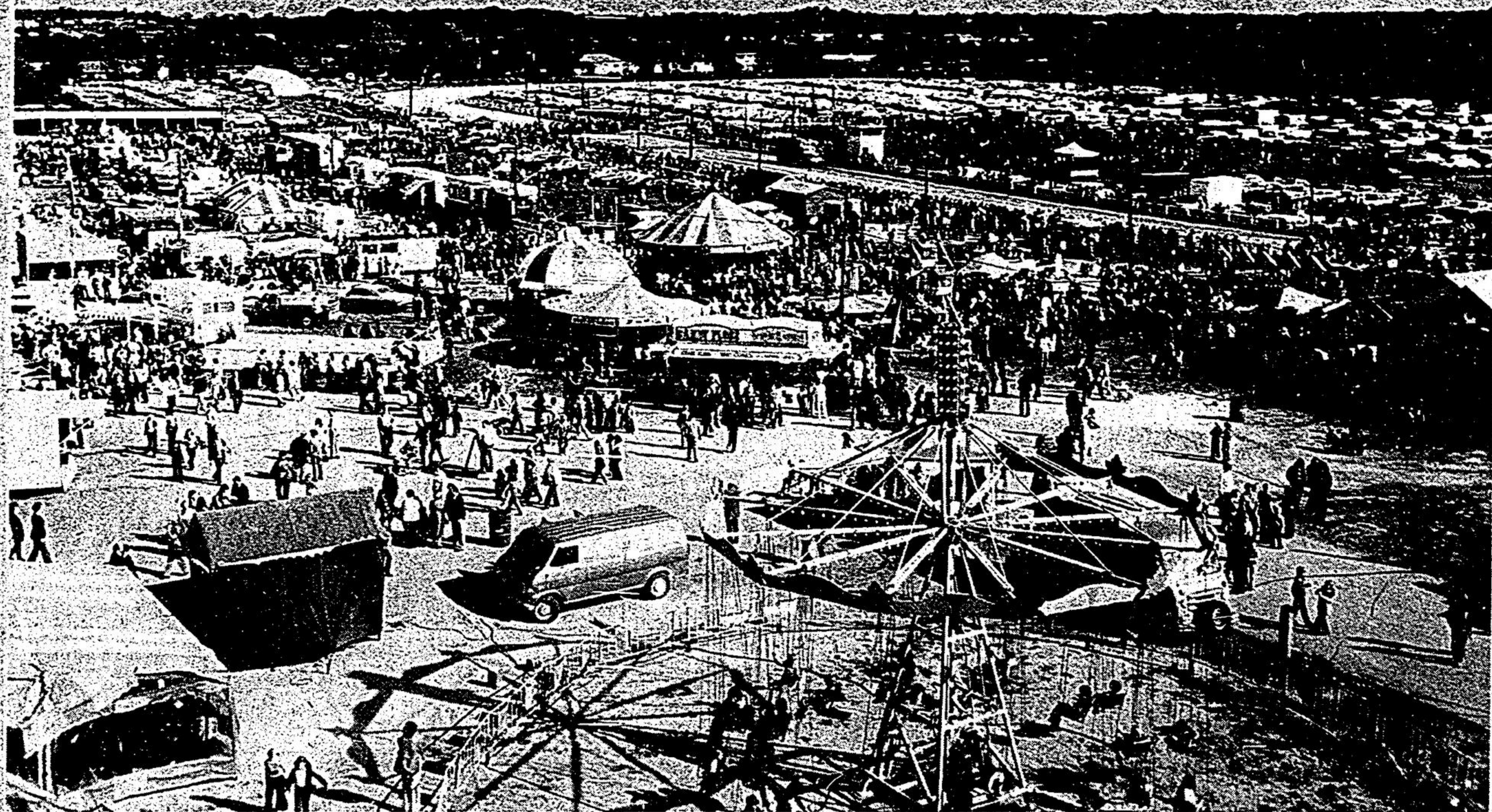
A bird's-eye view of Markham fairgrounds-1974

This is a bird's-eye view of Markham Fairgrounds from atop the midway ferris wheel. The scene is looking to the south-east, across the racetrack and into the parking area. The picture was taken by the Economist and Sun in 1974. Conklin Shows of C.N.E. fame, will be back this year and operating all four days, Oct. 2,3,4 5.