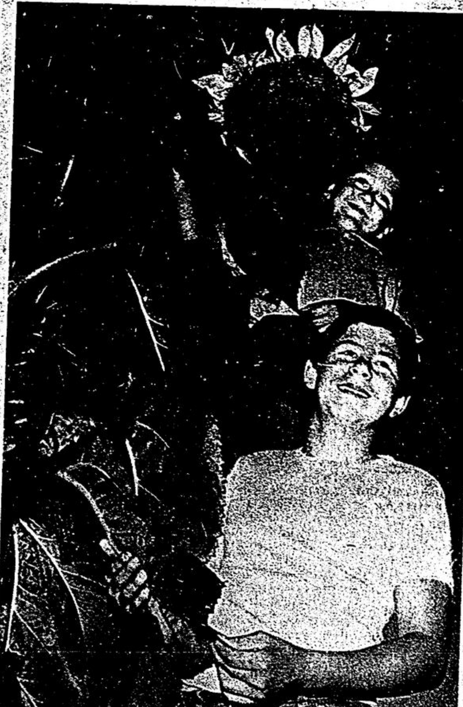
Giant sunflower plant

Save Square dance, corn roast The Save Stouffville Committee is sponsoring a square dance and corn roast Friday (Sept. 5) at Latcham, as a fund raising project for the organization. Square dancing will be to the country sound of the Nipissing County Boys. Stouffville Stompers will offer Dixieland music. Corn and soft drinks will be on sale. The event starts at 7 p.m. at 9 p.m., the winning ticket on the food draw will be held. First prize is a $750 food voucher at Stouffville IGA. Tickets for the draw are still available for $1 each.