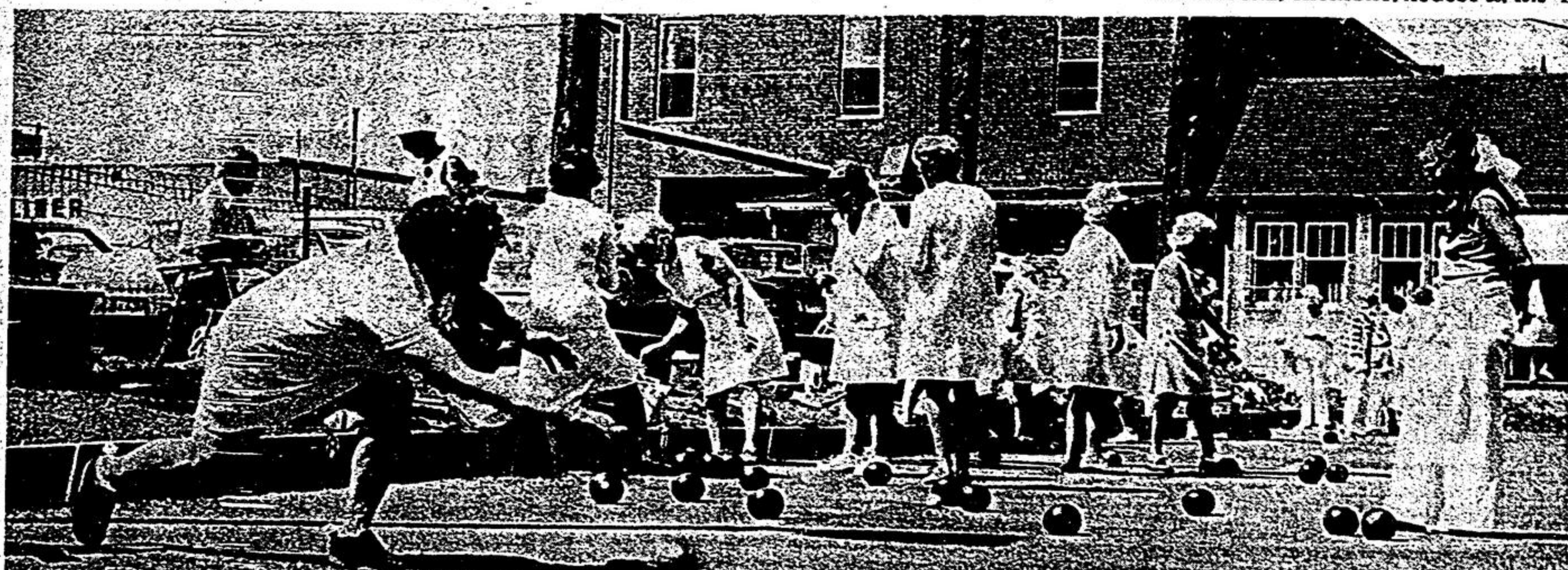
Stouffville ladies were well represented at the Stouffville Lawn Bowling Club during a recent tournament. Teams from Toronto, Oshawa and elsewhere attended.