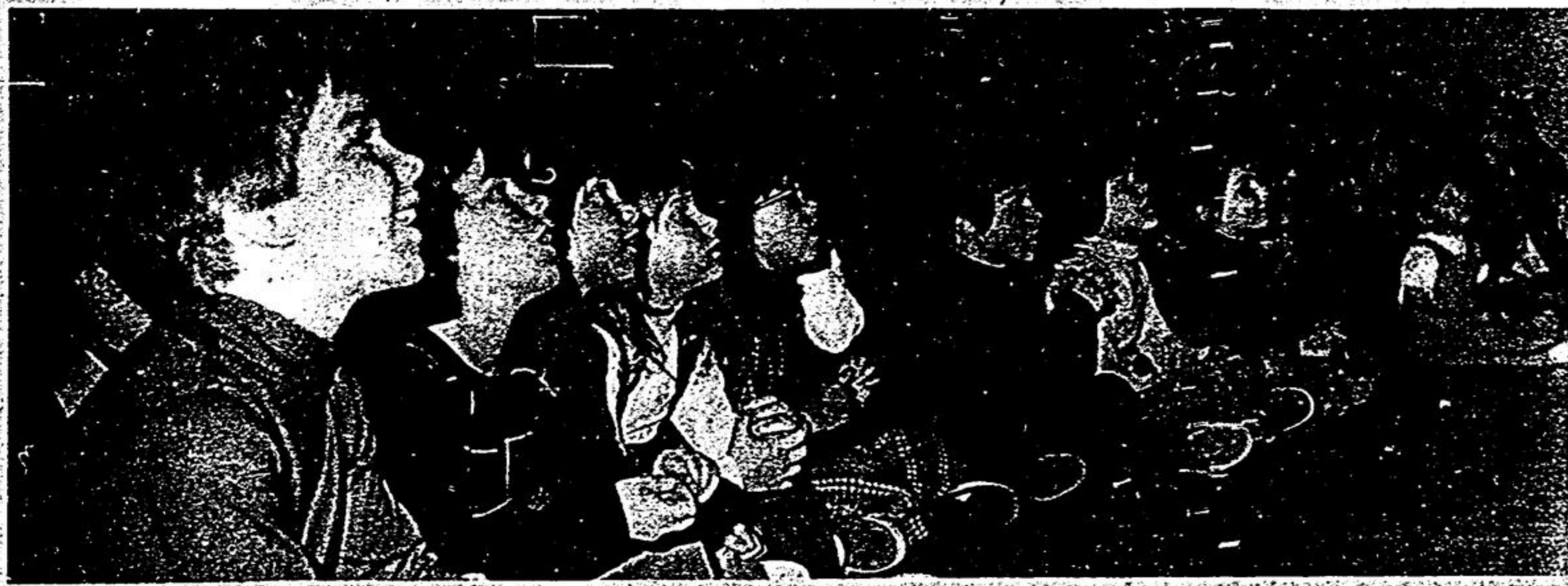
These Goodwood-Webb Public School children were entranced by the Pepe Puppet Theatre, a group of professional puppeteers, last week as they performed "The Magic Forest." Some parents and others were on hand as well as a part of the Education Week program.