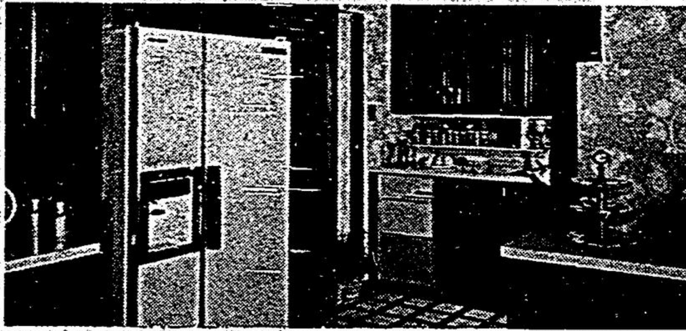
WHAT ONCE WAS A HUGE, OLD-FASHIONED KITCHEN was remodelled by a professional designer to improve use of space, especially of storage space.

specialist who has prepared them, it is the practice of the reputable dealer to include his design fees in the cost of your kitchen.