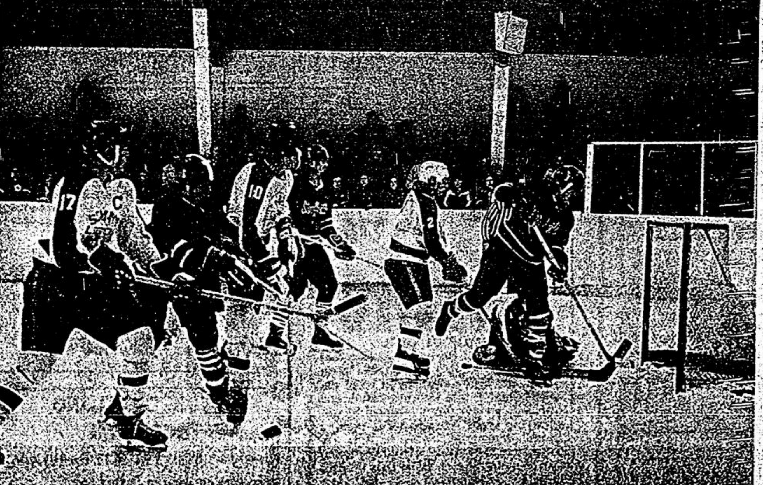
A Stouffville juvenile player skaters past a prone St. Mary's goalie to plop the puck into the net on Monday night.