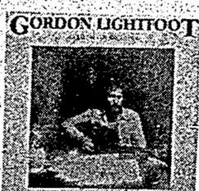
GORDON LIGHTFOOT Cold On The Shoulder