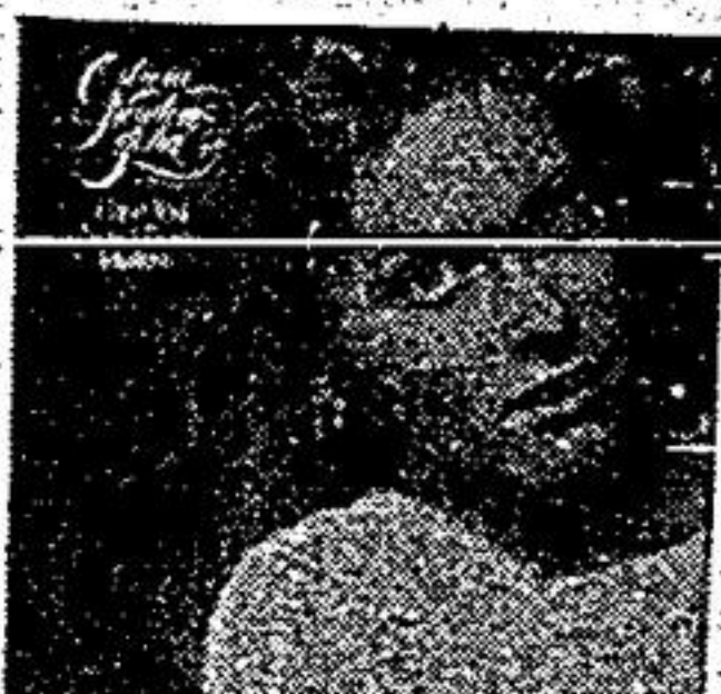
OLIVIA NEWTON-JOHN Have You Never Been Mellow