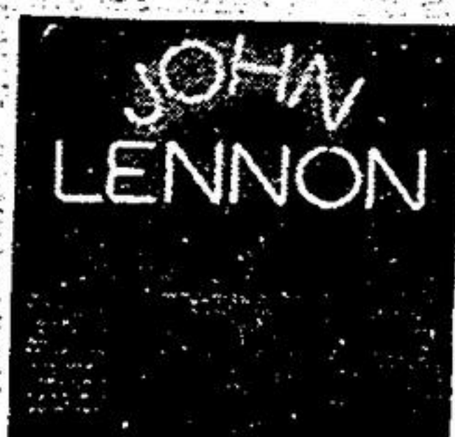
JOHN LENNON Rock 'N' Roll