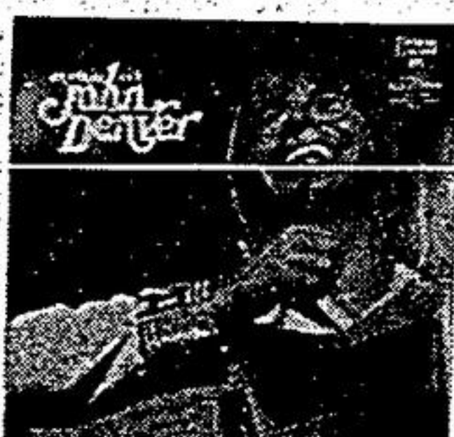
JOHN DENVER An Evening With John Denver