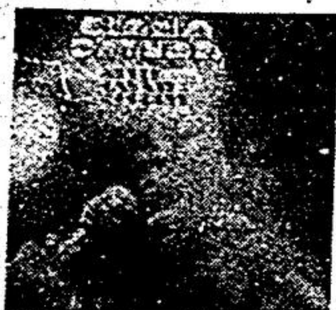
GLORIA GAYNOR Never Can Say Goodbye