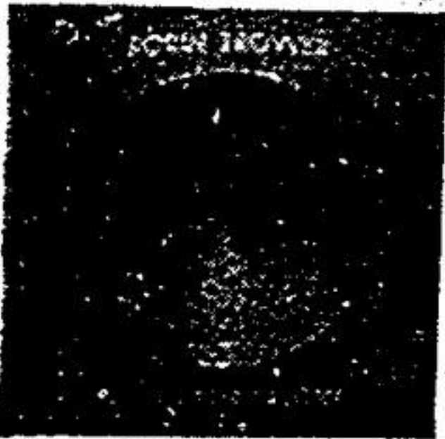
ROBIN TROWER For Earth Below

"SPRING SAVINGS" SALE ON MARCH 20, 21, 22 LIMITED QUANTITIES