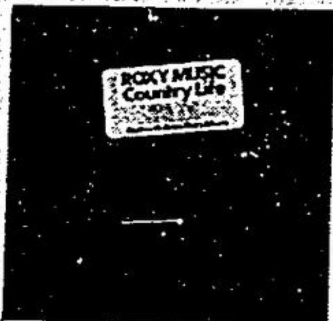
ROXY MUSIC Country Life