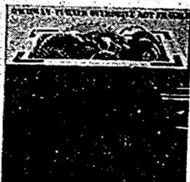
BACHMAN TURNER OVERDRIVE Not Fragile