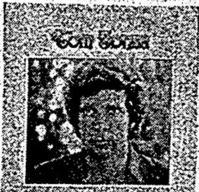
TOM JONES Somethin' Bout You Baby I Like