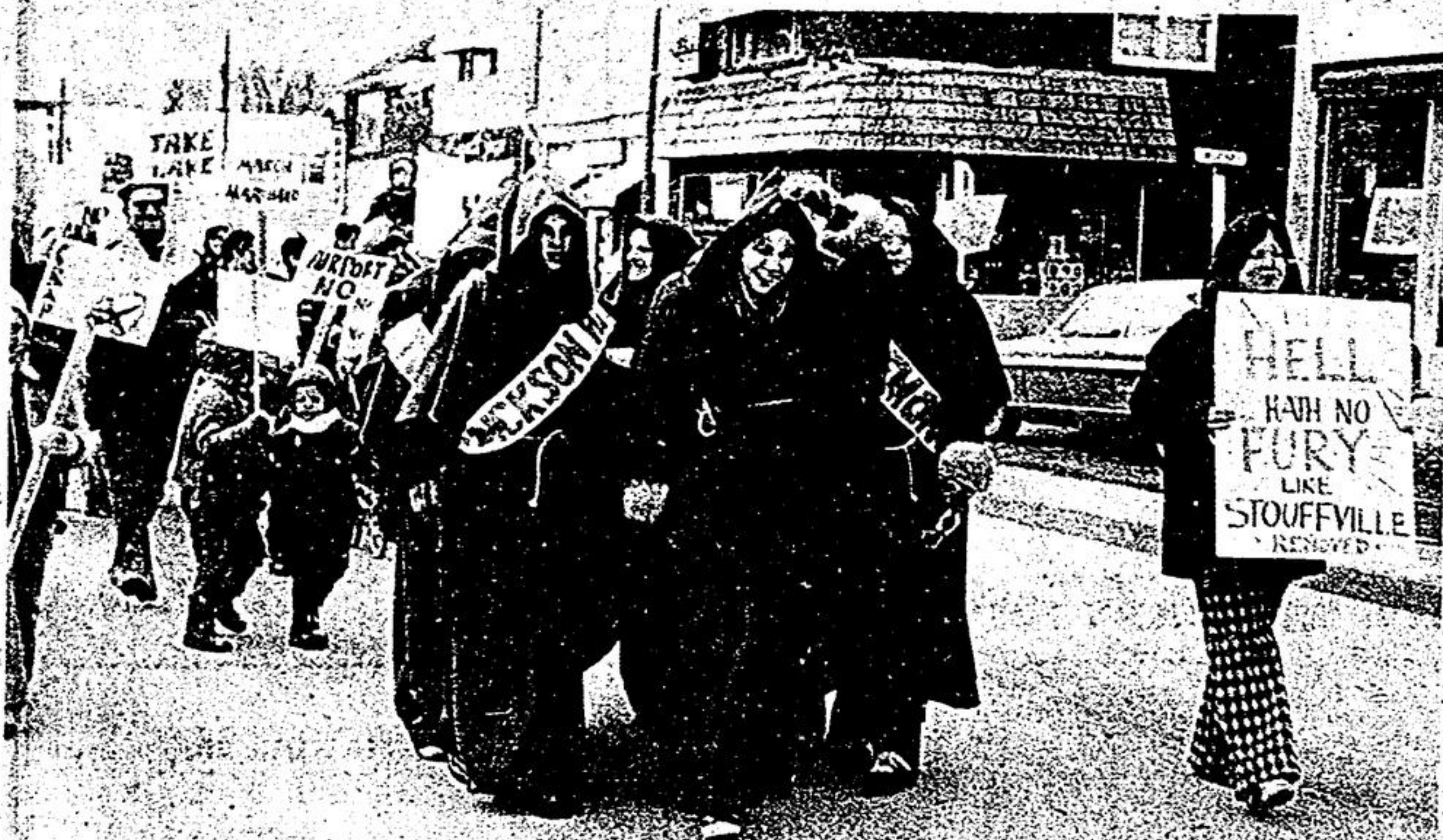
A funeral procession led the protest march down Main St. Monday as the death of Stouffville was being enacted. Here some hockey players, dressed as monks, carry a