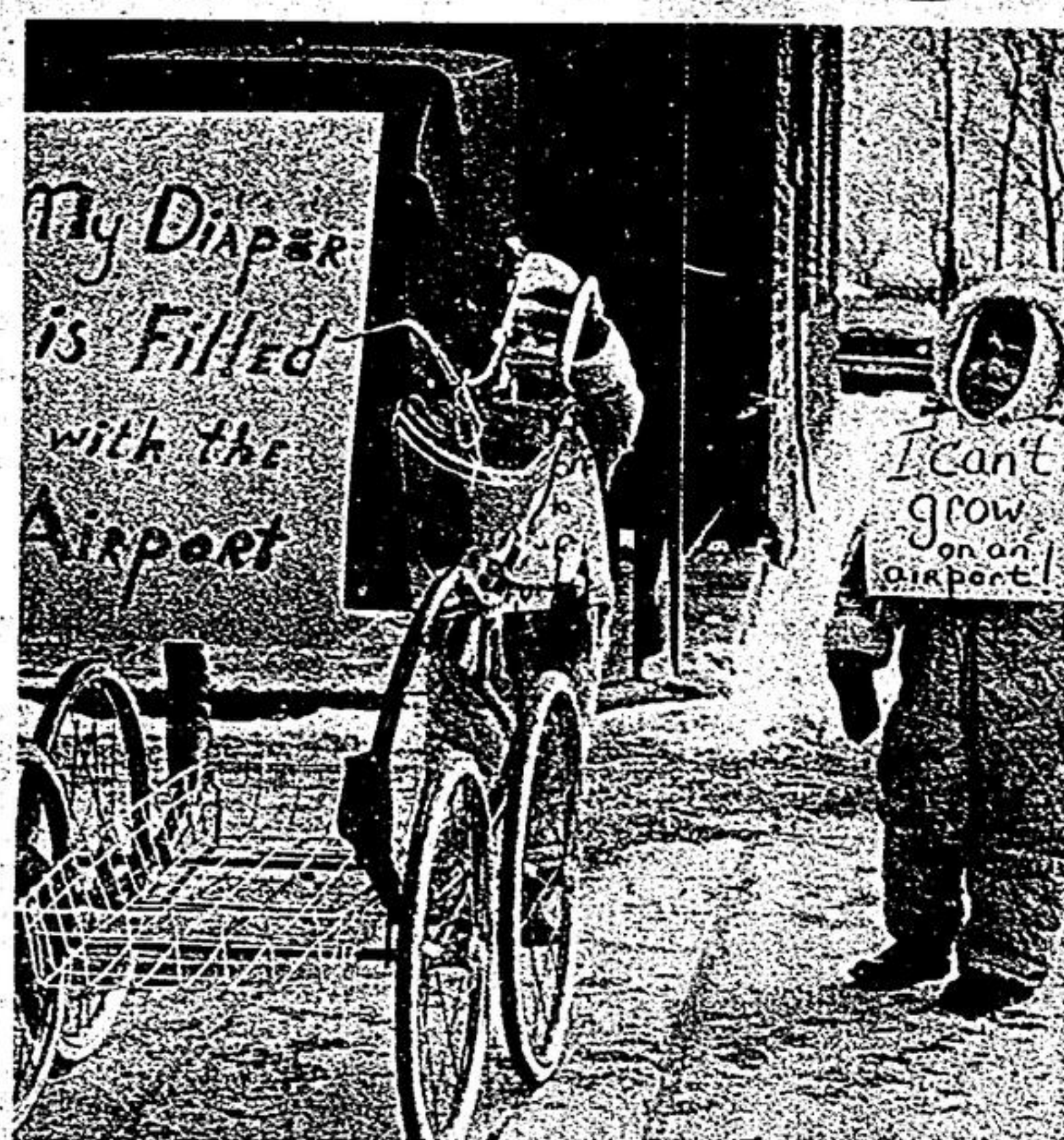
The signs carried by these young Stouffville residents pretty well speak for themselves as they joined their mother in the protest march Monday afternoon.

STOUFFVILLE — Normally placid Stouffville residents took to the street Monday afternoon to stage a protest March from O'Brien Ave. down Main St. to the municipal offices.