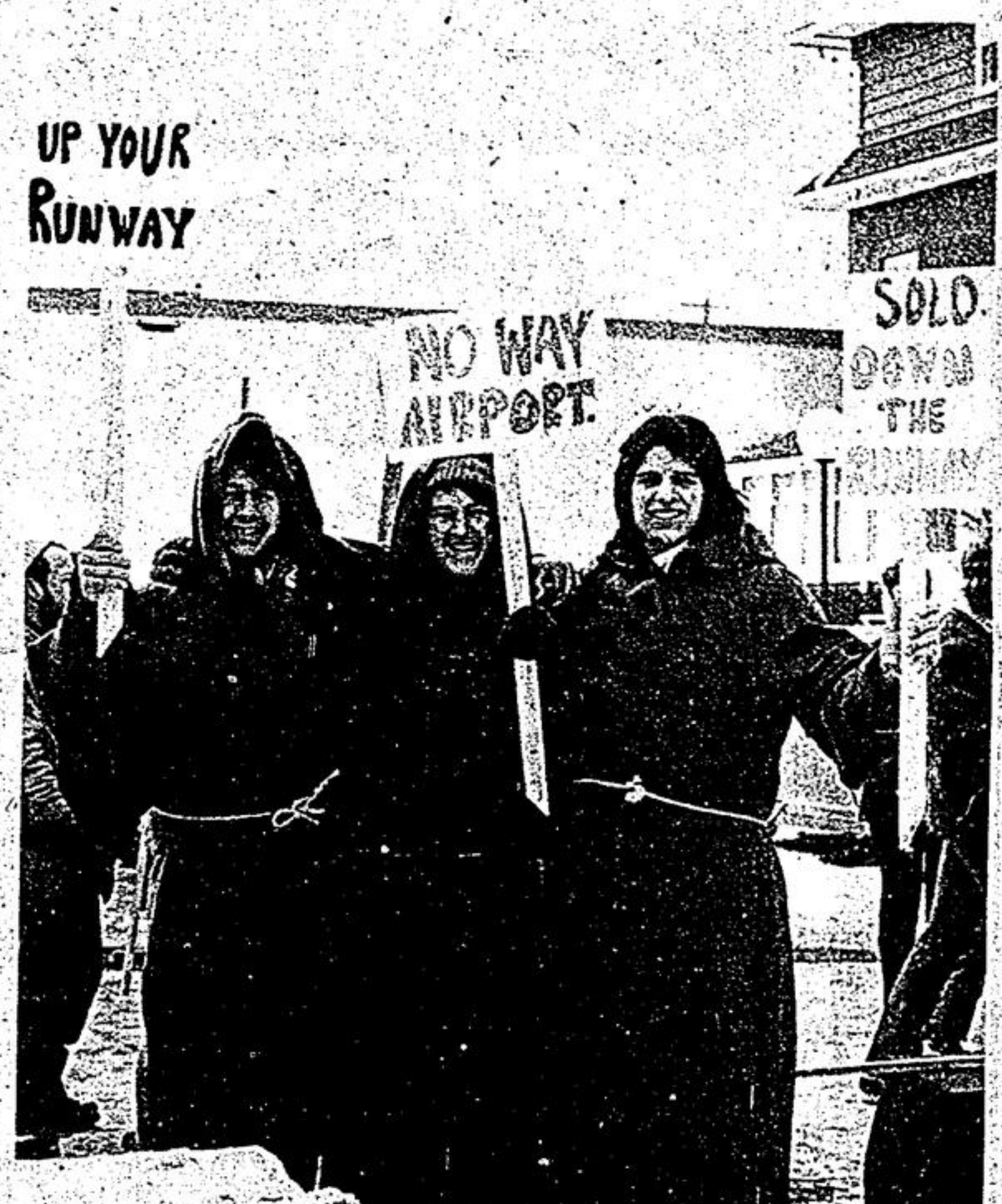
These three young men are not monks, really, but formed part of the protest march Monday. They carried the coffin down Main St. and here they stand in front of the municipal building. The signs are self-explanatory.