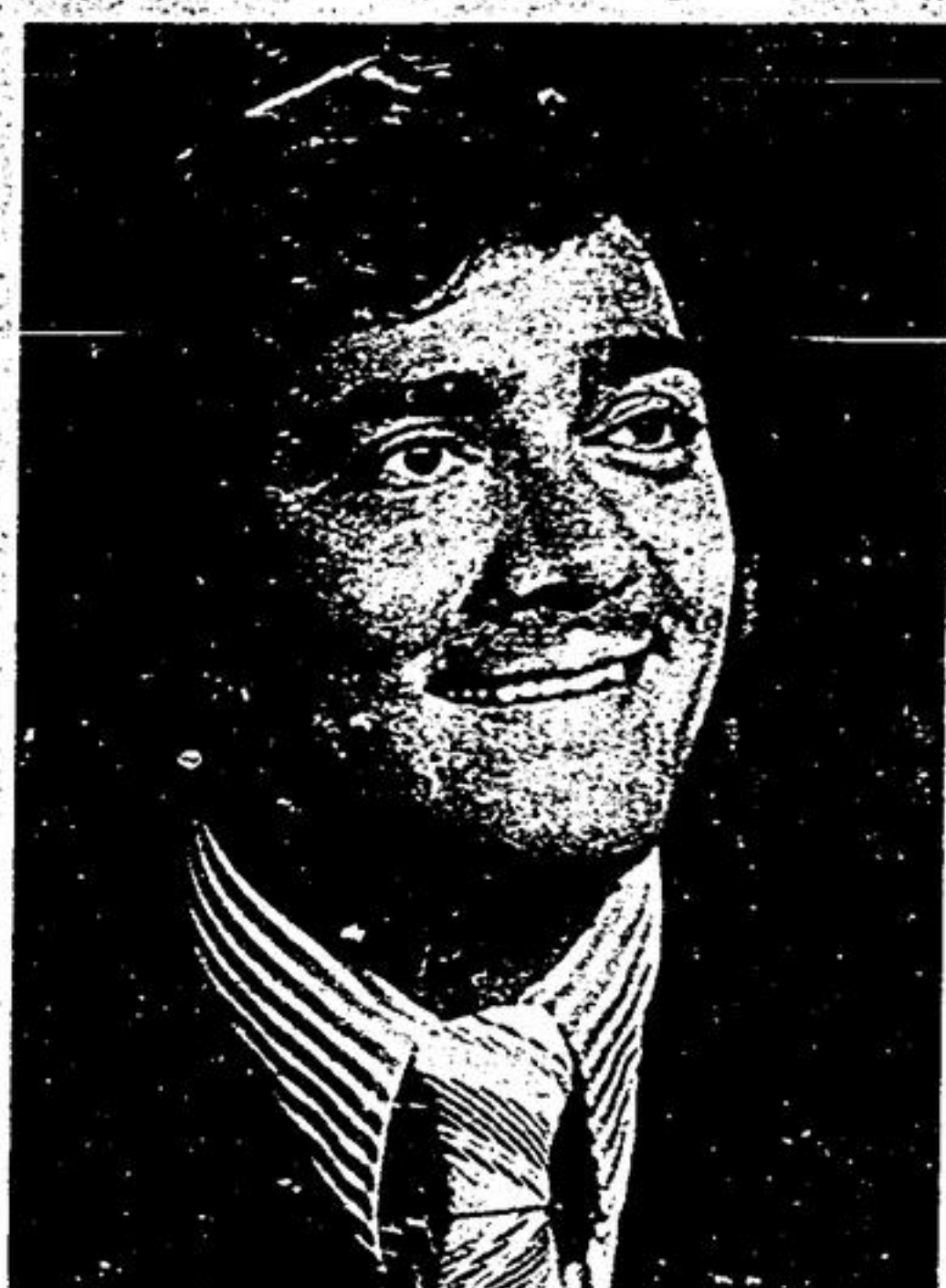
The duo conducted a week-long crusade at the church last year and this is a follow-up program.