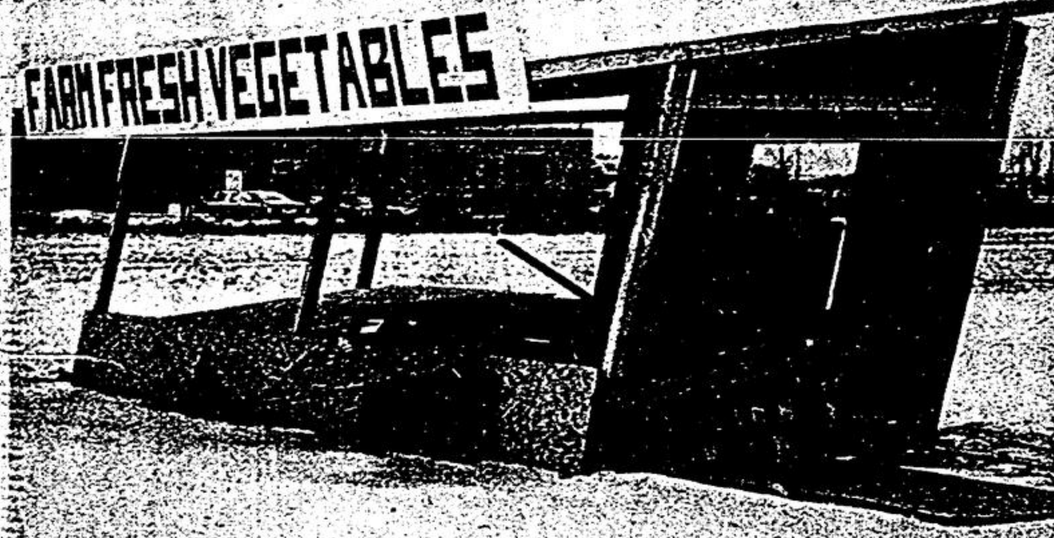
The forlorn vegetable stand on Highway 47 west of Stouffville is rather a pathetic sight as it leans over seemingly ready to collapse with even the slightest breeze. It seems to