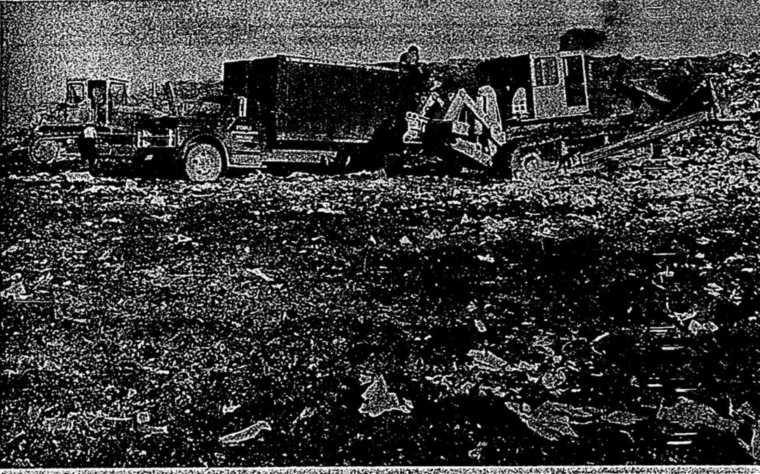
Dump issue a running battle

York Sanitation dump on Highway 48 was a constant source of news during the past year. Residents insisted that the dump be closed and the Town of Whitchurch-Stouffville