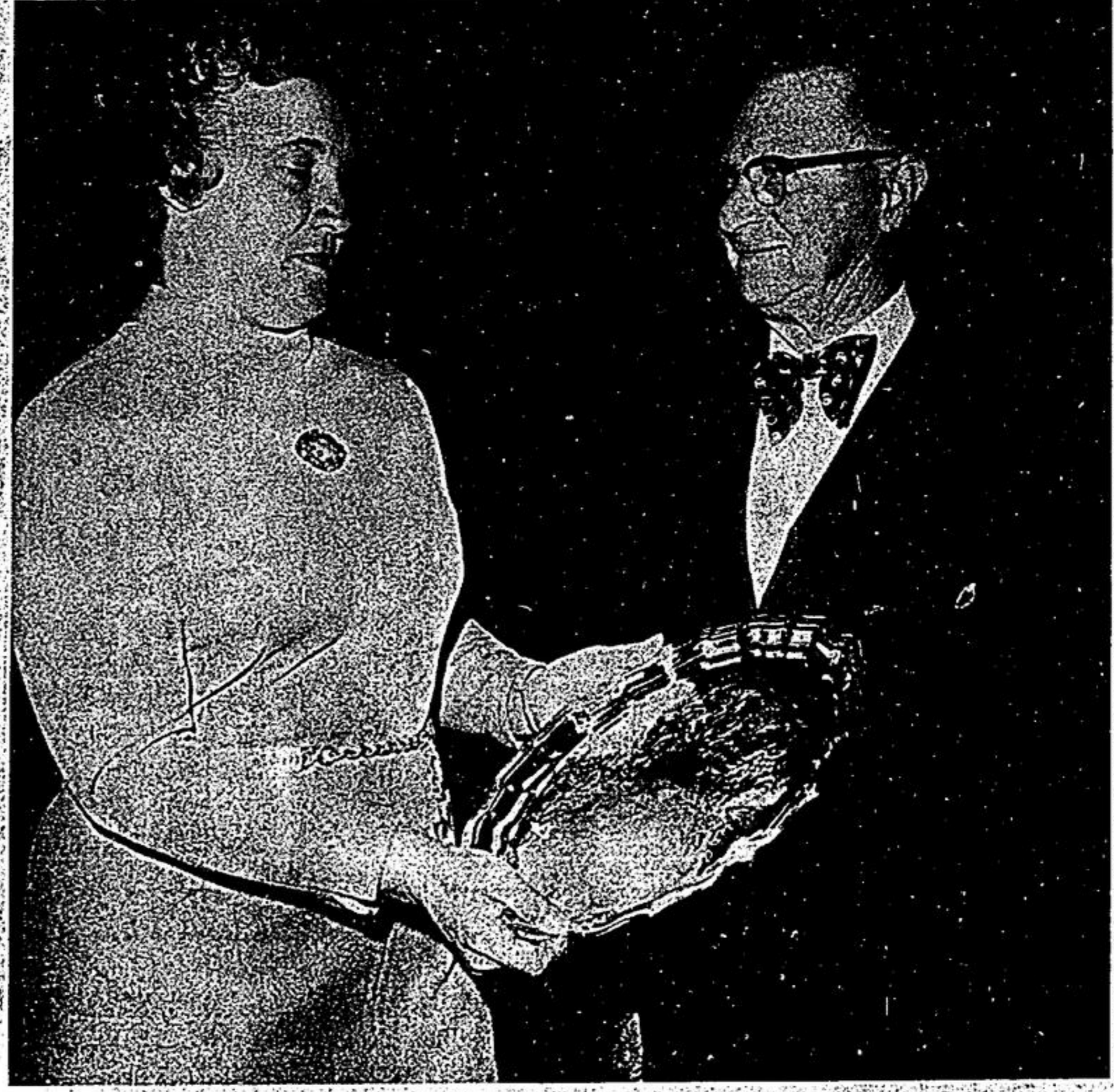
1974 marks society's 50th year