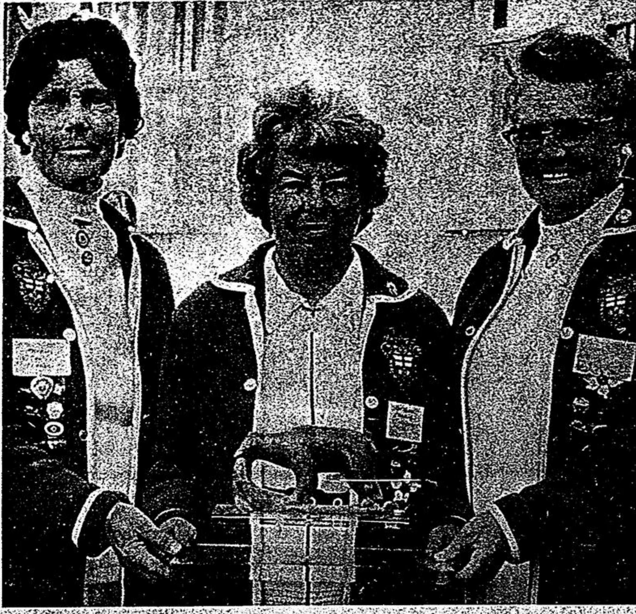
National bowling champions