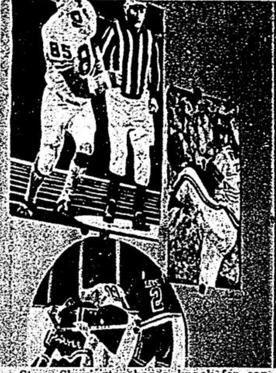
Steve Skyvington has a knack for capturing sports action in sketches and drawings.