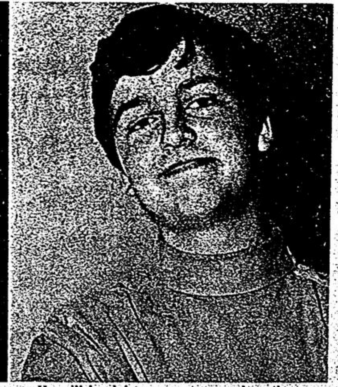
He will be doing a sports mural on the gym wall of SDSS.