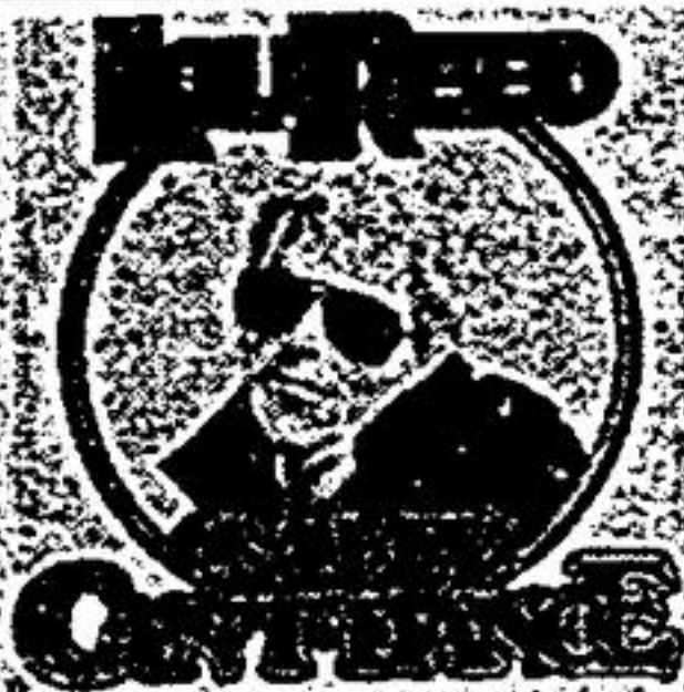
LOU REED "Sally Can't Dance"