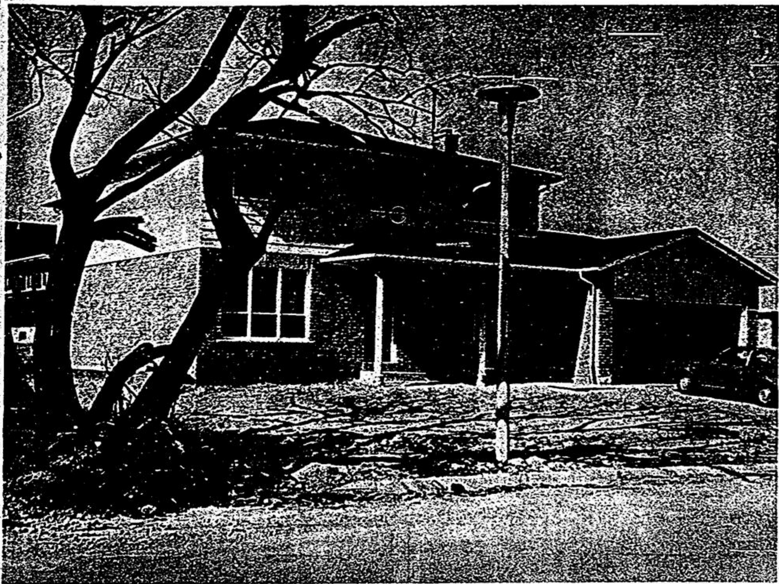
New people who have moved into the Baycrest Subdivision homes in the east section of the village feel Stouffville is a 'friendly' town, especially suited for bringing