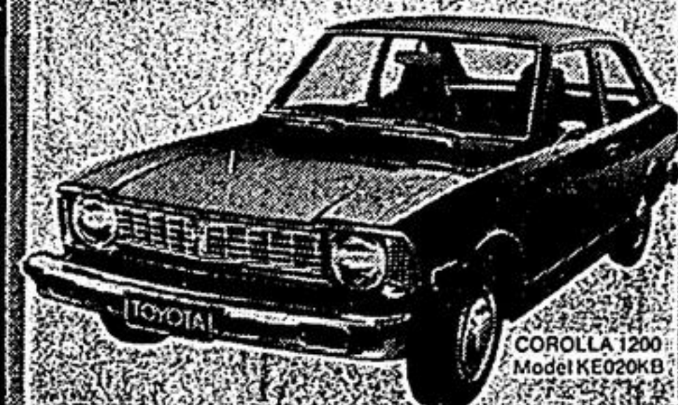
COROLLA 1200 Model KE020KB

We're the small car experts Click the Yellow Pages for the Toyota dealer nearest you.