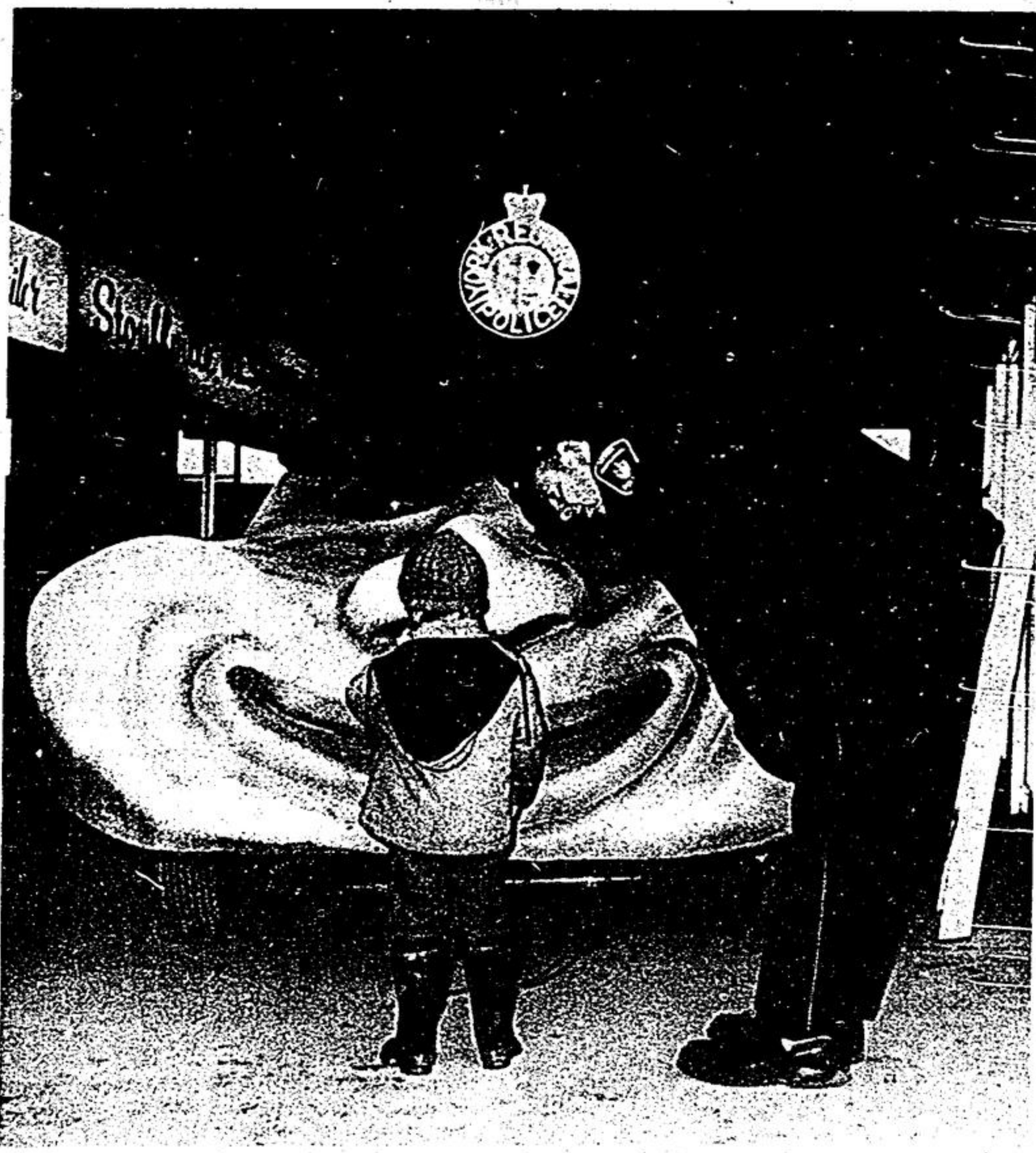
'Talking' police cruiser intrigues children