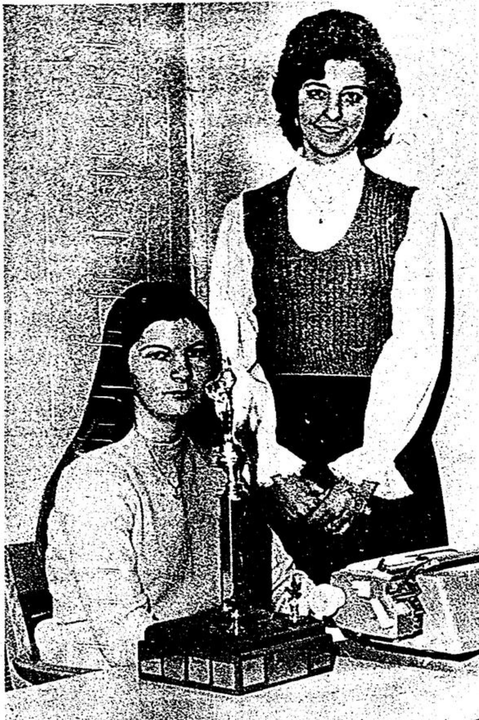
Fastest typists in York