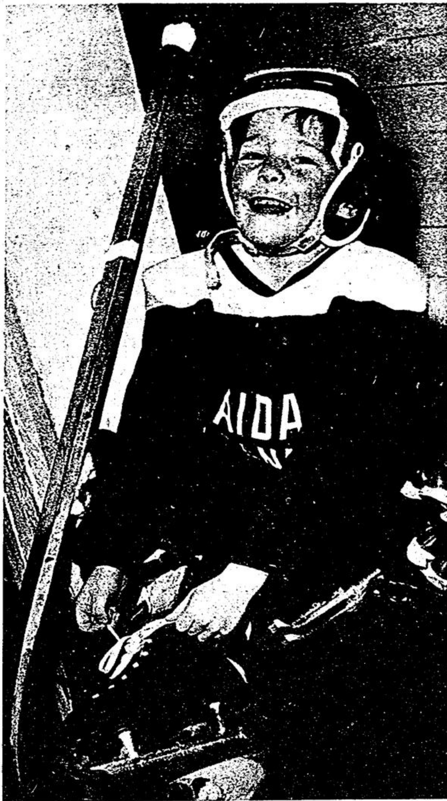
Happiness is - - - - -!