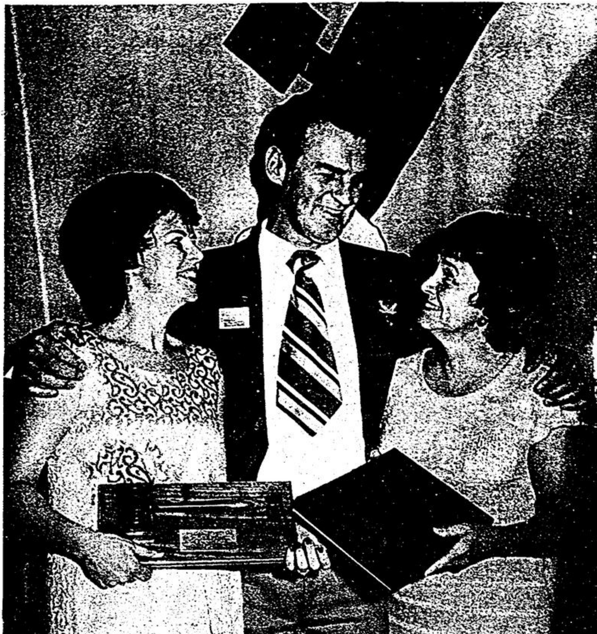
Hosts honor Swiss guests at civic banquet