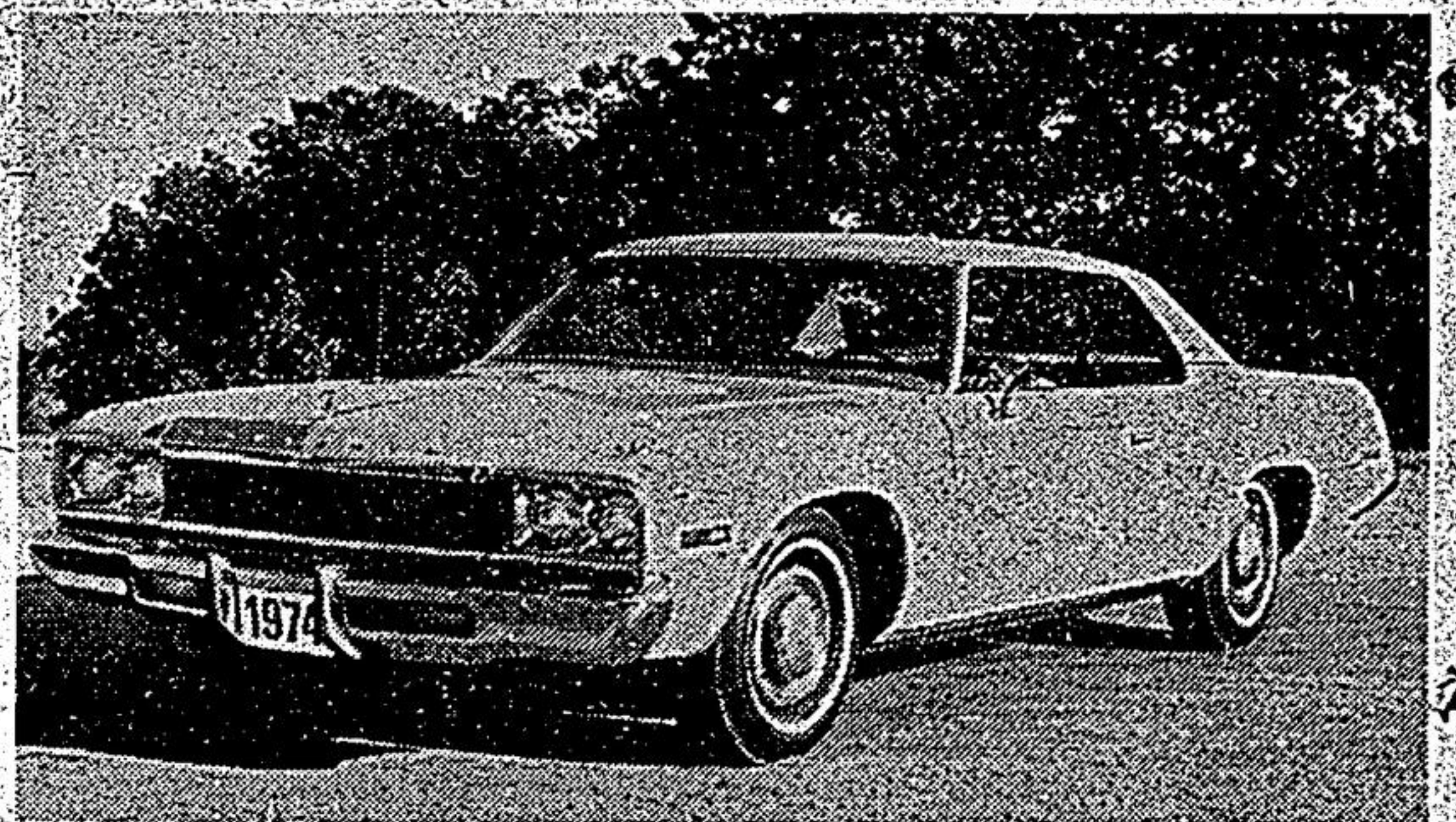
1974 PLYMOUTH FURY GRAN COUPE TWO-DOOR HARDTOP