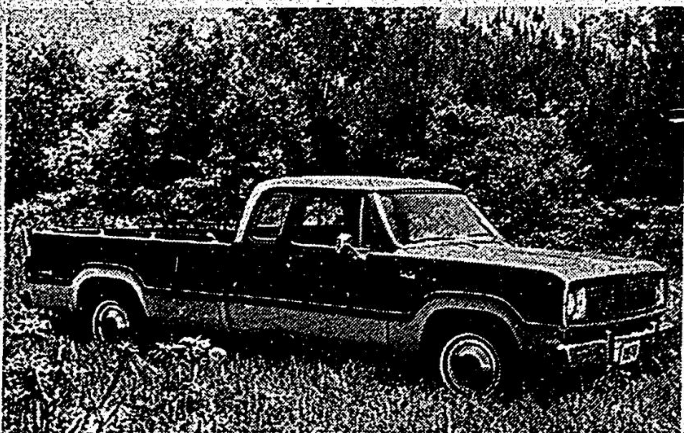
1974 DODGE D-100 ADVENTURER SE CLUB CAB