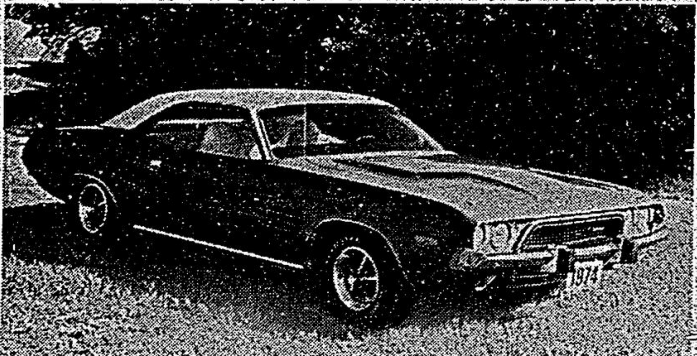
1974 DODGE CHALLENGER RALLEY TWO-DOOR HARDTOP