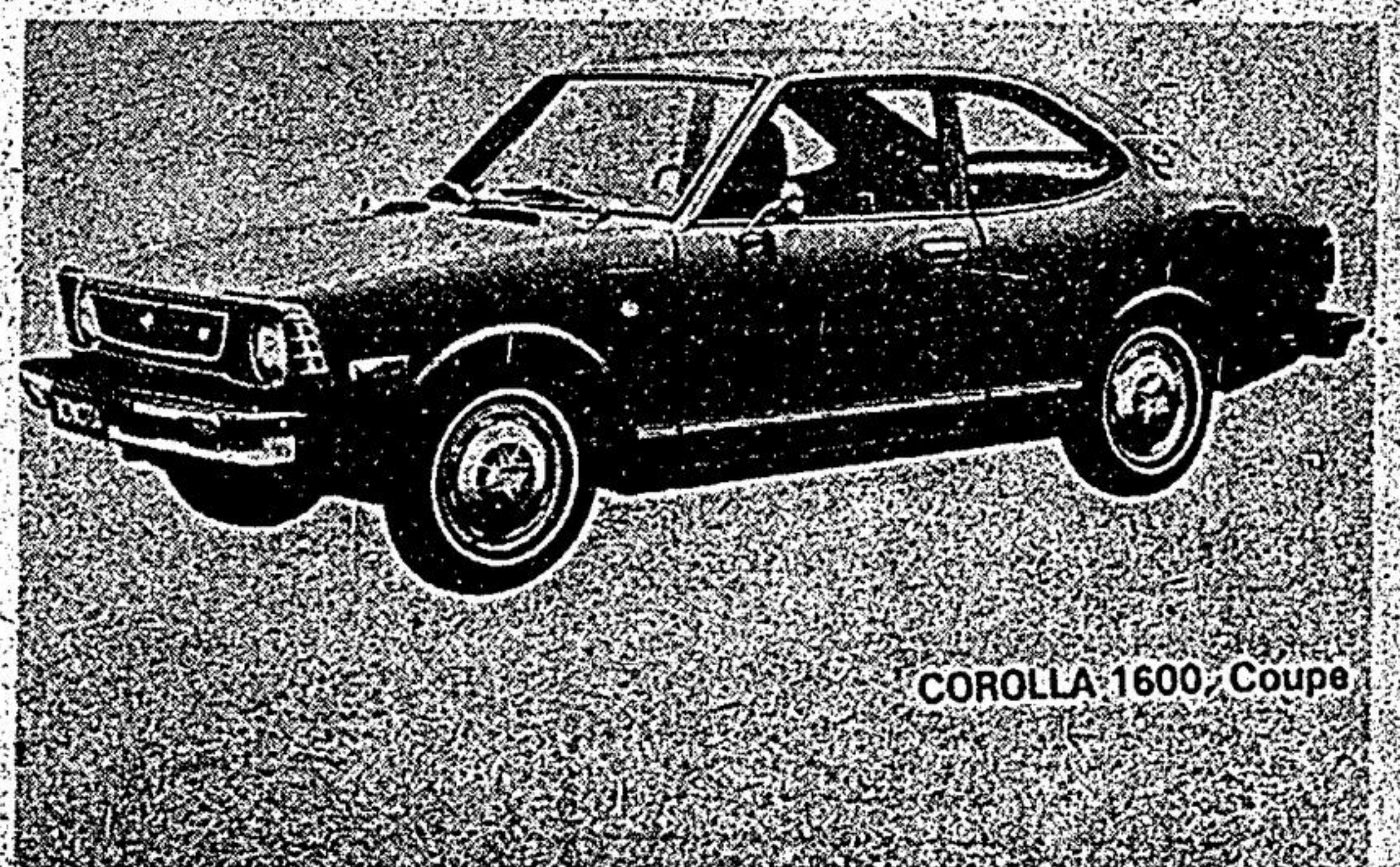
COROLLA 1600 Coupe