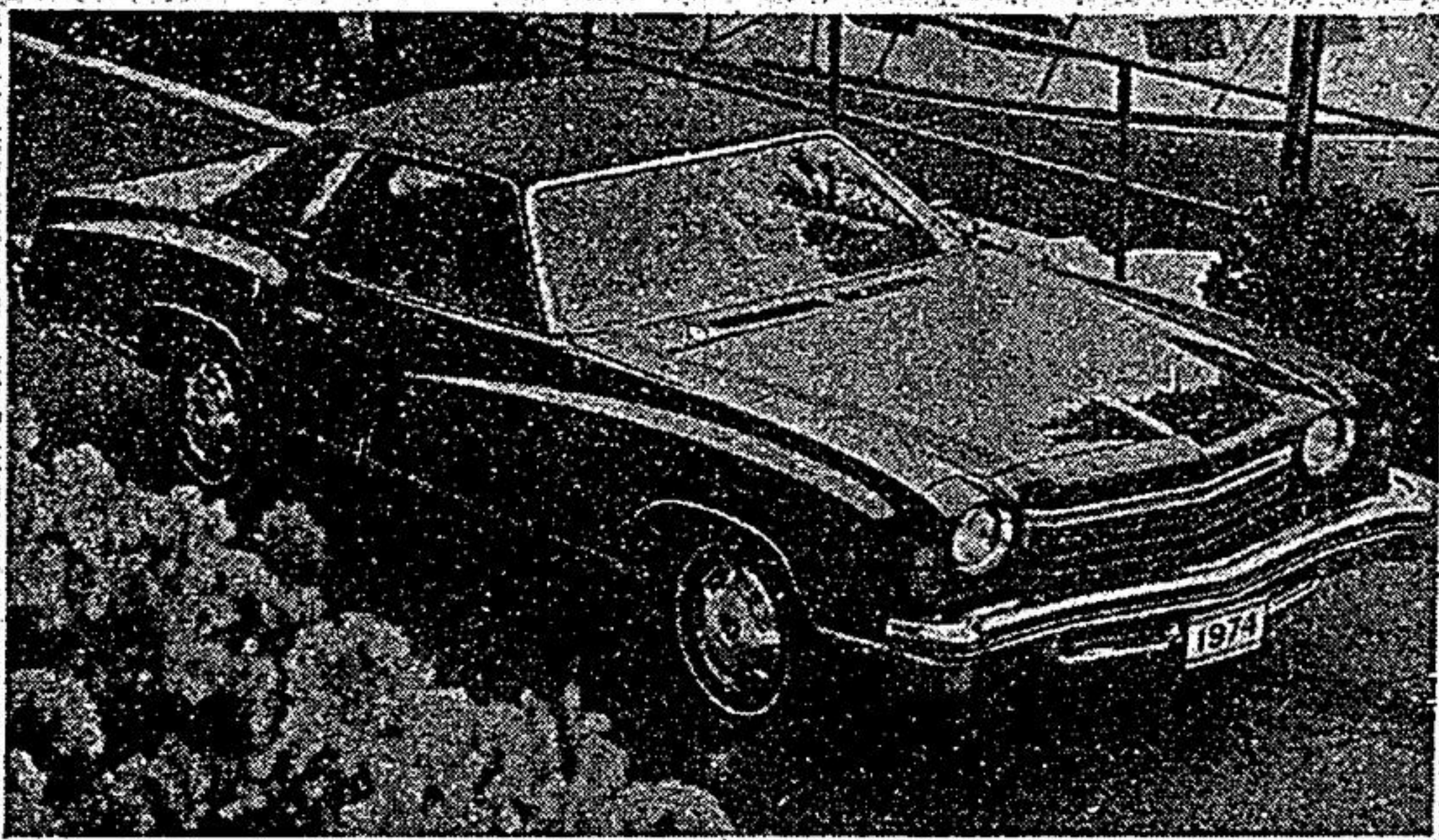
1974 CHEVROLET MONTE CARLO