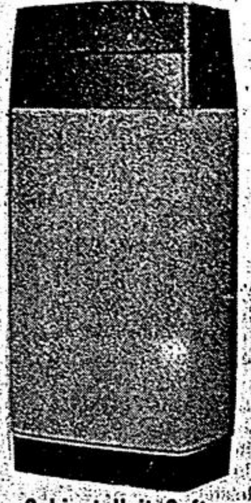
Cabinet Unit Softener