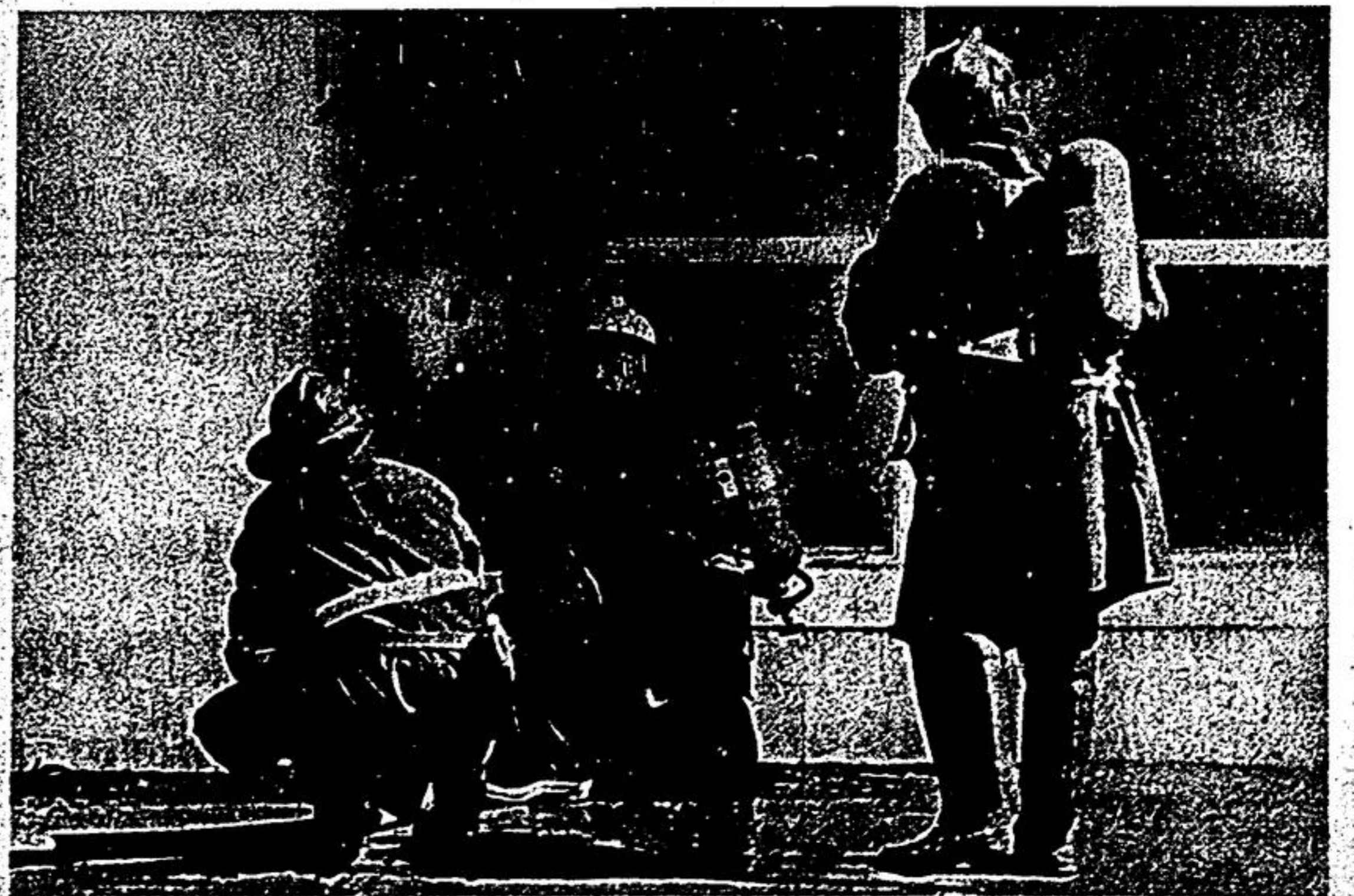
Firemen from Stouffville and Markham battled the stubborn blaze for over two hours. Water had to be trucked in by tankers from hydrants on Main Street.