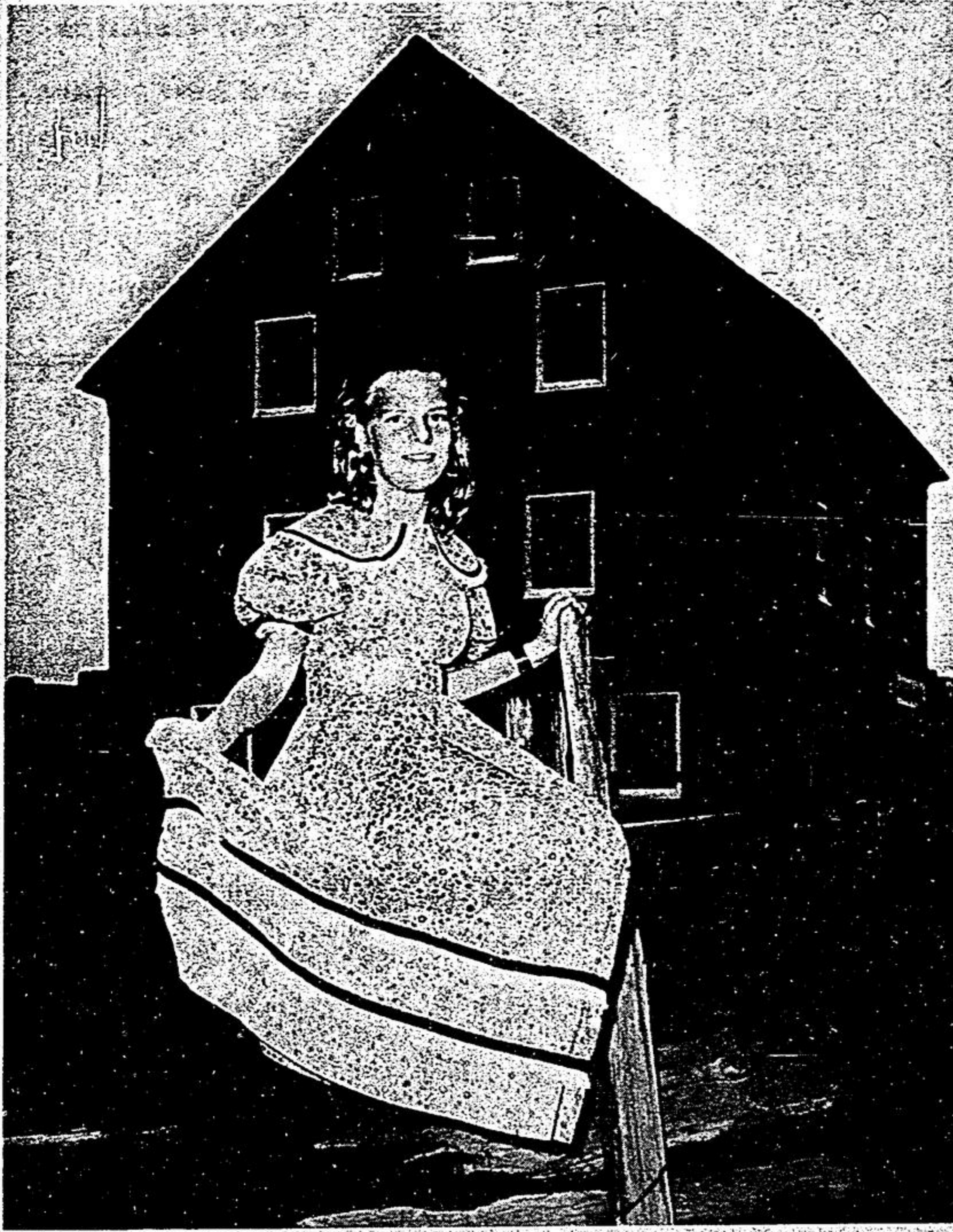
Pioneer past is brought to life